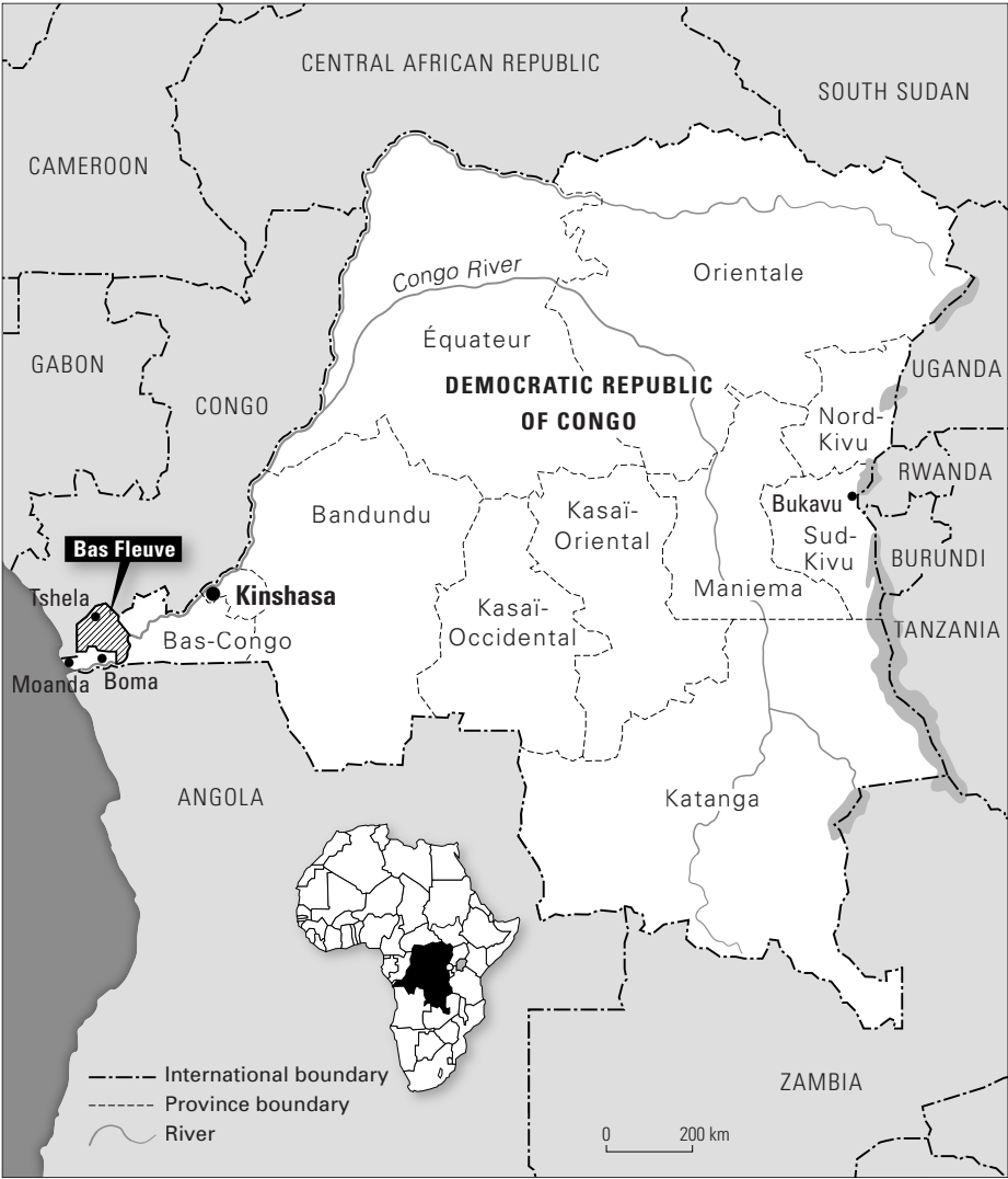
Map 1.1 Democratic Republic of Congo