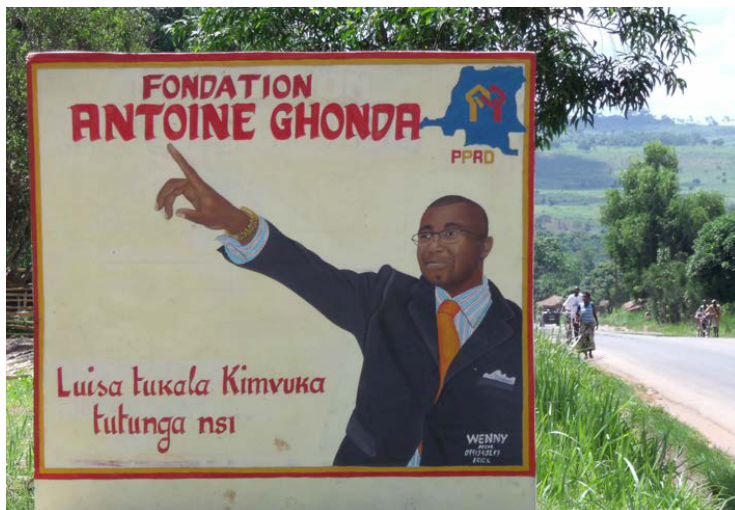
Photo 6.1 Sign in a village in the constituency of MP Antoine Ghonda in Bas Congo province ('Antoine Ghonda Foundation - join the effort to reconstruct the wealth of our country together') – Author's picture, December 2009.