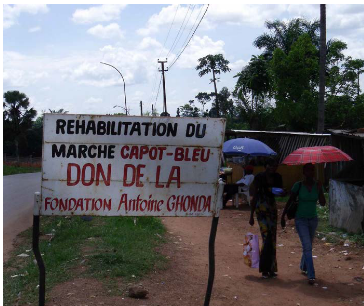
Picture 6.2 Sign in a village in the constituency of MP Antoine Ghonda in Bas Congo province ('rehabilitation of the market 'Blue Bonnet' provided by the Antoine Ghonda Foundation') – Author's picture, December 2009.