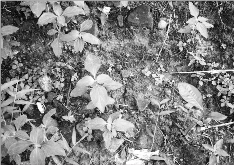
Photograph 3.7: Bricks of the ex-building of the elementary school which eroded.