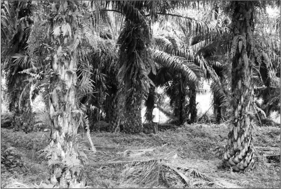
Photograph 3.6: An oil palm plantation in Gunung Tunggul. A man stands on the location of the ex-building of the elementary school for Baduy children in the resettlement village.