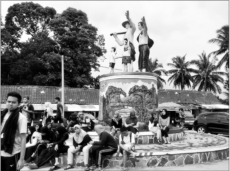
Photograph 3.10: A statue of a Baduy family welcoming visitors was erected in 1990.