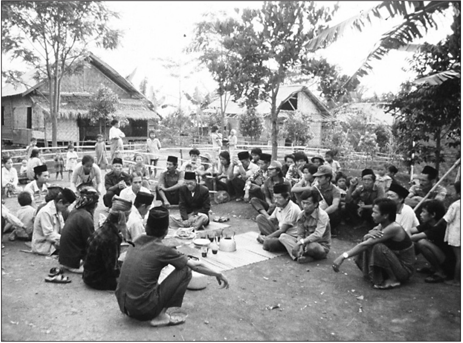
Photograph 3.2: A gathering between Baduy and officials in the resettlement village of Gunung Tunggul.