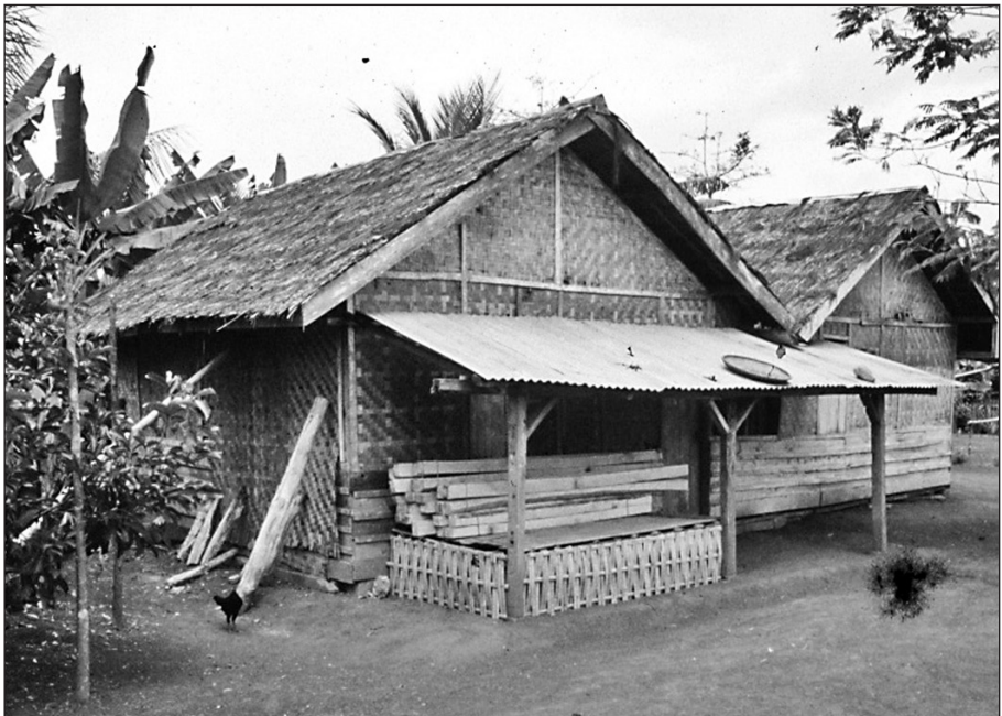
Photograph 3.5: A house of a Baduy in the resettlement village. Photograph was taken by Gerard Persoon in 1985. Printed with permission.