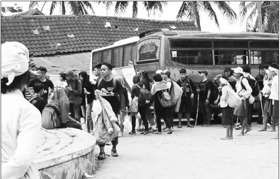
Photograph 3.11: Tourists are welcomed by the Baduy in Ciboleger.