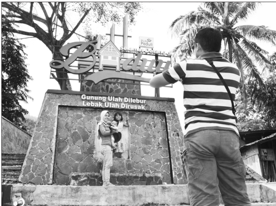
Photograph 3.12: A family takes a picture in the border of the Baduy land in Ciboleger.