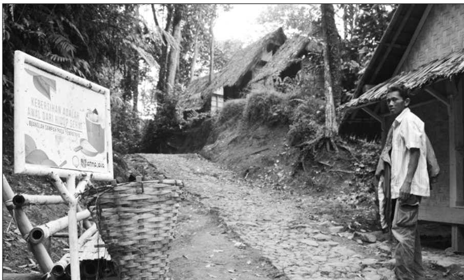
Photograph 3.13: A man looks at a board made by students of Atma Jaya University to remind the tourists to keep the Baduy land clean from garbage.