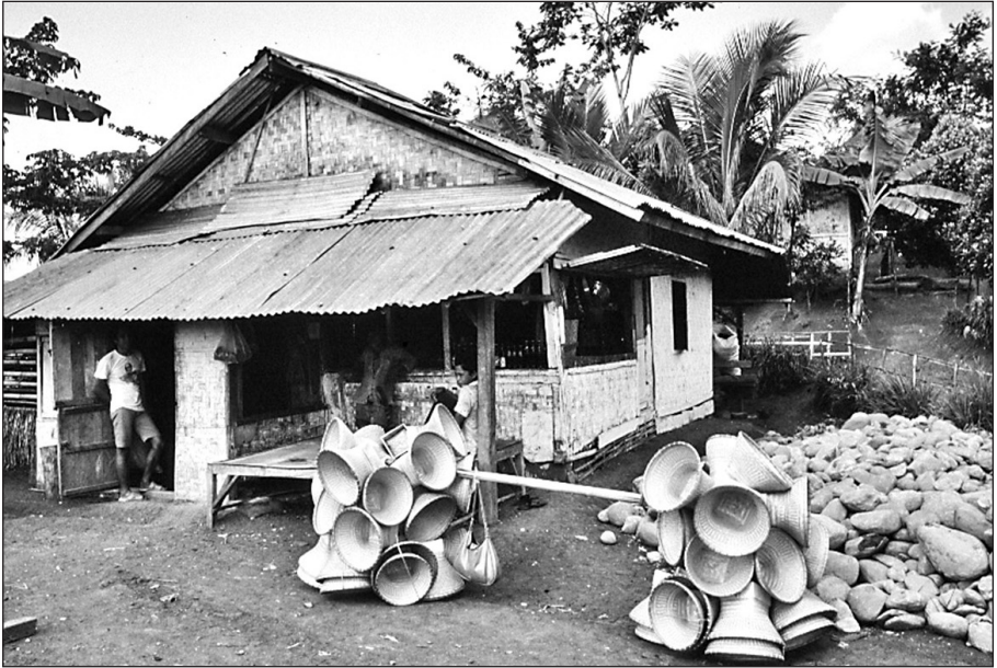
Photograph 3.4: A house of a Baduy in the resettlement village. Photograph was taken by Gerard Persoon in 1985. Printed with permission.