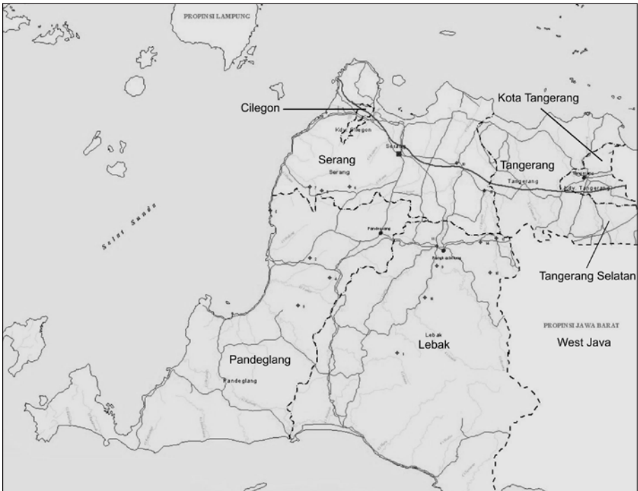
Map 2: Banten Province