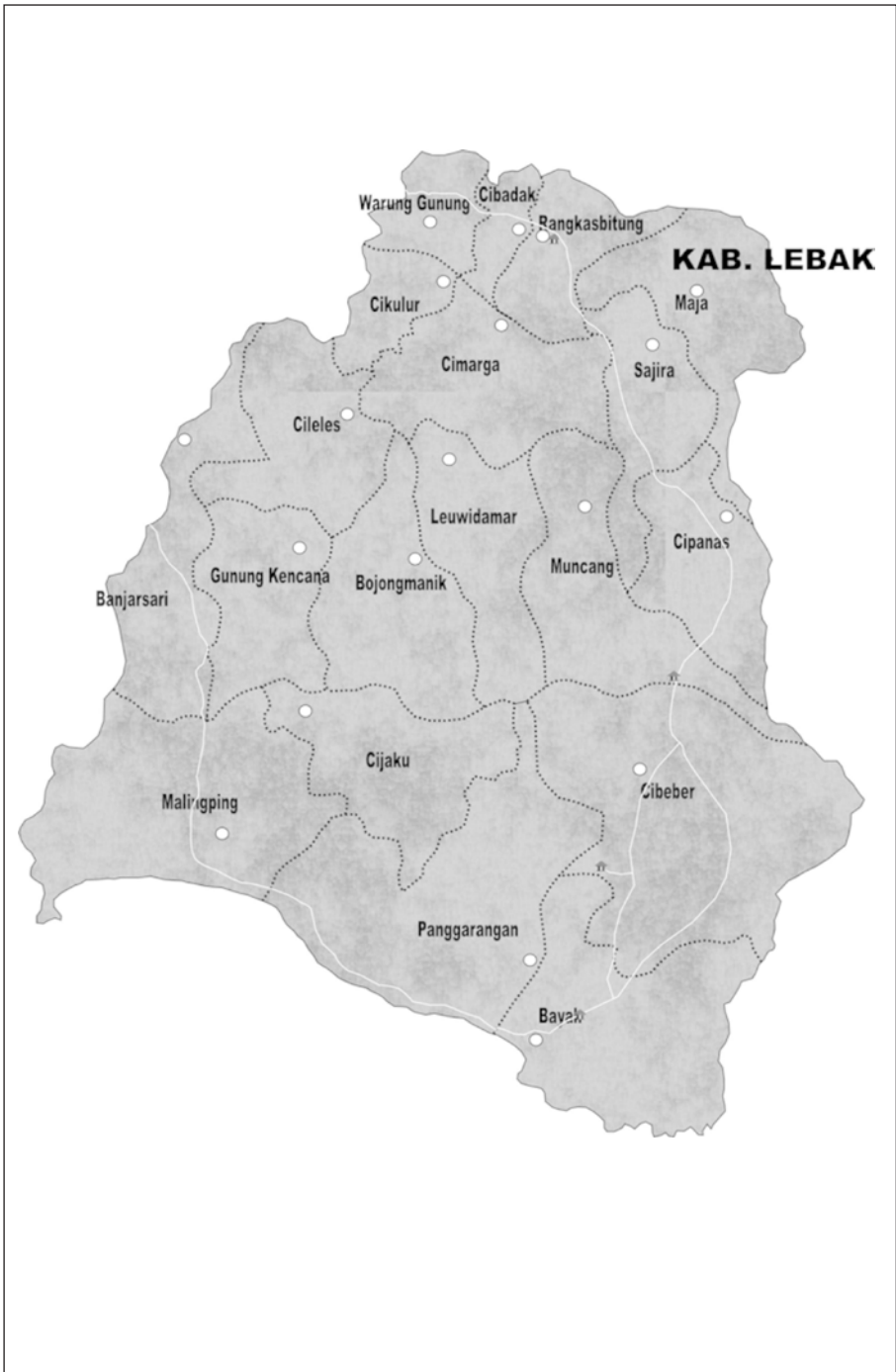
Map 3: Lebak Regency