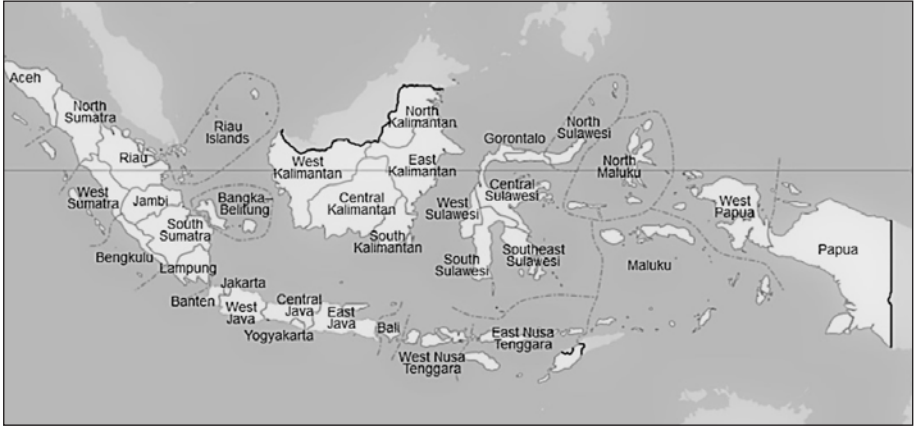
Map 1: Indonesia