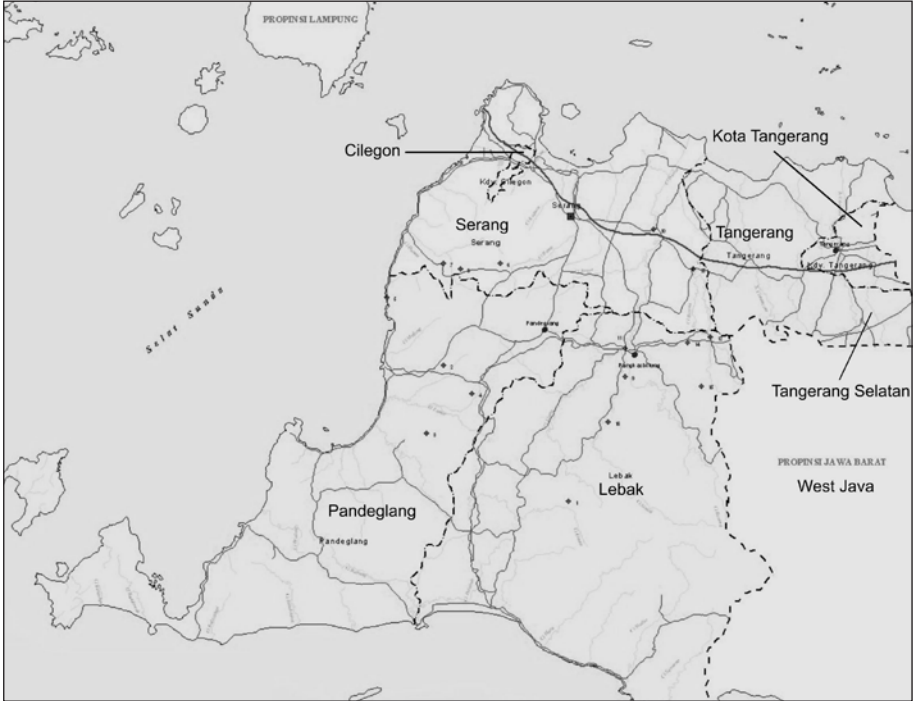
Map 2: Banten Province