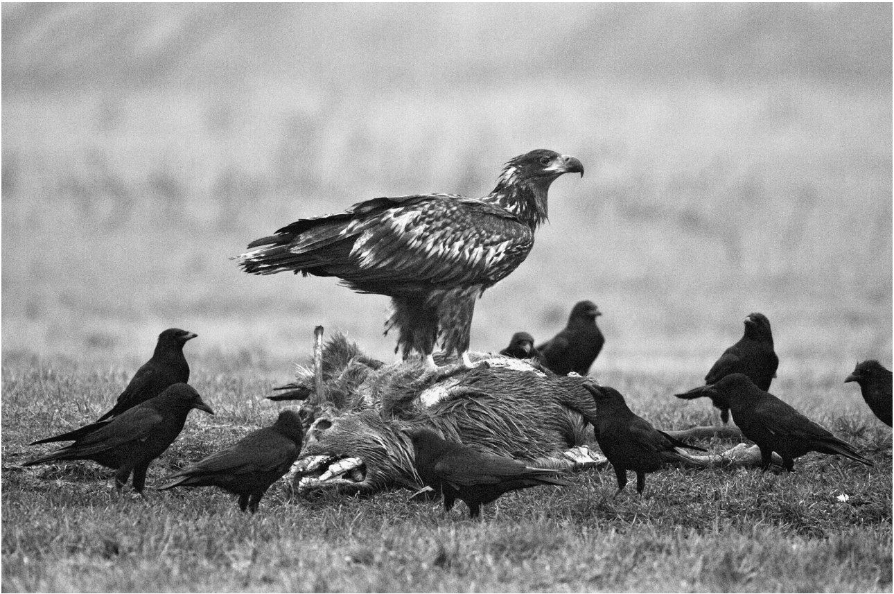
Figure 15.2 White-tailed eagle on top of prey (young red deer).

(Flevoland). A webcam placed next to the nest by Staatsbos-beheer, the Dutch national forestry service, registered how in March 2007 several eggs were laid in the nest and how one female bird survived and left the nest in July. Therefore it should be realized this bird can only be used with caution as a seasonal indicator species.