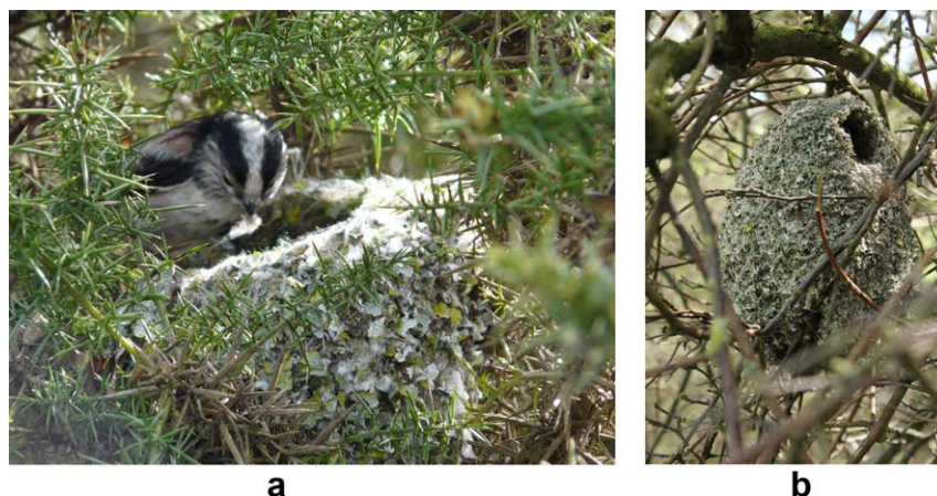
Figure 3. Nests created by long-tailed tits ( Aegithalos caudatus ), Great Britain. Long-tailed tits build their nests from thousands of pieces of lichen, moss, and spiderweb, as well as numerous feathers. The nests are thought to be a result of innate instructions and individual learning. Photograph A shows a nest under construction, while photograph B shows a completed nest. (Color figure can be viewed in the online issue, which is available at wileyonlinelibrary.com .)

were the case, Kenward and colleagues 103:1340 contend, we would not see “inherited action patterns that must have evolved through selection and that are crucial in sustaining tool-oriented behavior in adult crows.” The same point has been made with respect to the tool-use behavior of hyacinth macaws, Egyptian vultures, and woodpecker finches, the only other bird species that is known to habitually use stick tools in the wild. 104–106