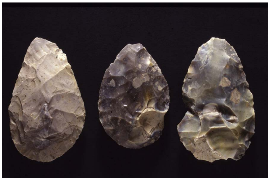
Figure 1. Acheulean handaxes from the site of Boxgrove, England, which dates to about 500 Ka. The handaxes are made of flint and are between 12 and 14.5 cm in length. (Color figure can be viewed in the online issue, which is available at wileyonlinelibrary.com .)

The former is represented by several early African specimens and the latter by Eurasian and later African specimens. The hypodigm of H. heidelbergensis includes specimens from East Africa, South Africa, Europe, South Asia, and East Asia. 6 H. heidelbergensis is sometimes argued to be a “wastebasket” taxon. Those who choose to split this taxon into two species usually assign Eurasian speci-