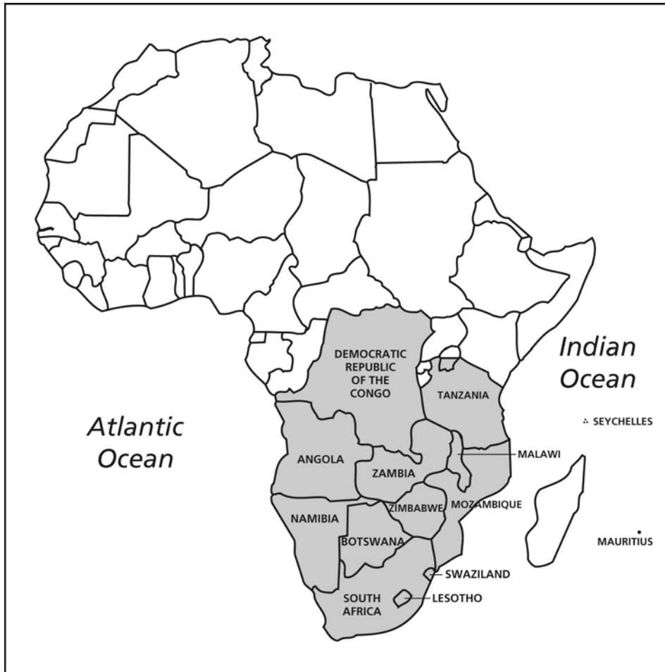
Map 1 The Southern African Development Community (SADC) area