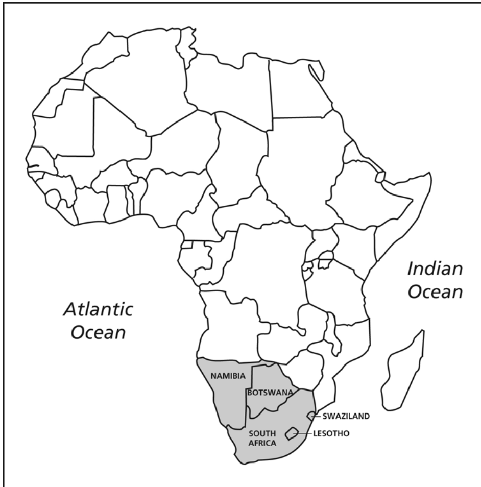
Map 2 The five countries of the Southern African Customs Union (SACU)