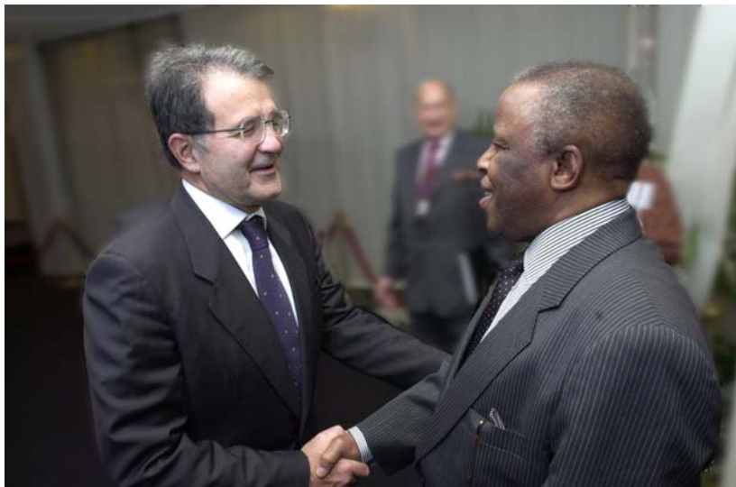
Photo 5 Former President of the European Commission Romano Prodi and Botswana President Festus Mogae

have in fact not been allocated. 57 This does not necessarily render these payments less important. The initial plans for budgetary support still reflect the EU's intentions. However, similar commitments were also made outside the EISP, stating that where enhanced free trade with the EU created fiscal difficulties, LDCs would be eligible for additional budgetary support. 58 Cancellation of the EISP payments does not seem to have been due to a change in aid directives. The same 2002 EC report on trade and development states that 'to facilitate the adjustment process resulting from multilateral and regional trade agreements, the Commission intends to continue and extend this kind of [budgetary] support'. 59