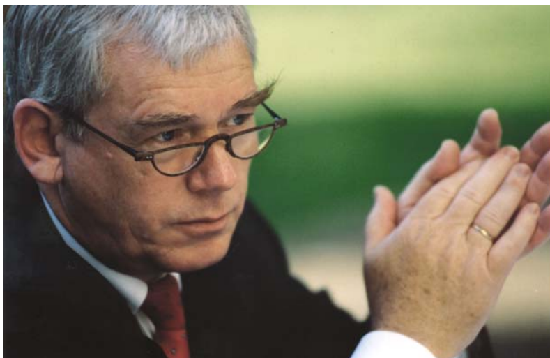
Photo 2 Paul Nielson, European Commissioner for Development and Humanitarian Aid from 1999 to 2004