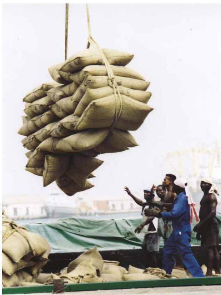
Photo 1 Trade in Africa: Takoradi, Ghana

had grown sceptical about their economic bonds with the western world, which they perceived as a relationship of dependency based on the legacy of colonialism. 17 African plans for a New International Economic Order (NIEO) called for a change in the international economic system that would increasingly favour African and other Third World countries' economies. 18 In 1975 the first of four Lomé Conventions was thus signed between the