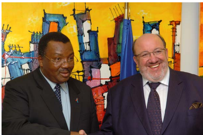
Photo 4 Prime Minister of Swaziland Themba Dlamini and European Commissioner for Development Louis Michel, 22 November 2005

this money was meant ‘to help Swaziland cope with any fall-out or effects from the South Africa-EU free trade agreement’. 47