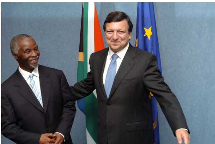
Photo 3 South African President Thabo Mbeki and President of the European Commission Jose Manuel Barosso

The advent of a new South African government also marked a new beginning for enhanced African economic cooperation. In recent years, South African government officials have increasingly travelled the continent to settle violent disputes and to forge stronger political and economic links in Africa. In 1998 South African President Thabo Mbeki gave a speech at the United Nations University in Tokyo entitled ‘The African Renaissance, South Africa and the World’, 50 in which he spoke of new ambitions for Africa’s development that were to be pursued through a communal African economic programme. This would help the continent to lift itself out of its position of economic exclusion from the rest of the world.