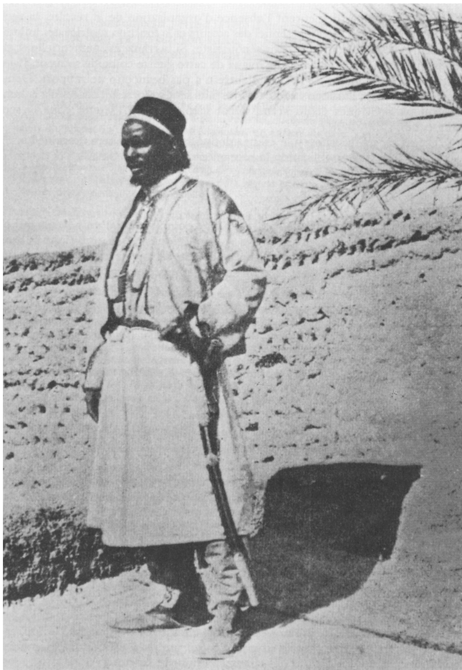
Kawousan ag Kedda

Copyright: 'Touaregs exil et résistance', Revue du Monde Musulman et de la Méditerranée , 57 (Paris, 1990)