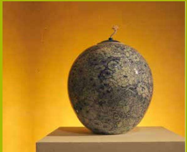
Freedom Flowers Project Manuel Salvisberg and Ai Weiwei 2014/15 Bomb and urn