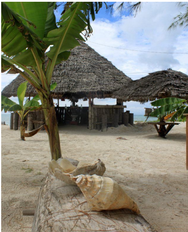
Jambo bar in the morning. Only the bar has a roof, so people can dance here underneath the stars, in the sand, right in front of the ocean. This place is an ultimate playground where at night many sexual activities occur.

Ideal partners for Zanzibari men are Western women around the age of thirty that already have a steady job and a wish for children, as they are ready for, and can offer, stability. Younger girls, while being together with them can certainly enhance a status as they would be harder to get and more beautiful, are often still in school which indicates a lack of financial means. Moreover, they are still adventurous and eager to travel, which does not create a stabile basis. Other men just like a specific woman more than they like other women. Those men want to be with her because of the special feelings towards her. However, all Zanzibari men I spoke to seemed to be aware of the advantages and profits of marrying a Western woman. Therefore, relationships can be seen as based on transactional love, as part of the benefits are businesswise and financially. But, feelings of love and affection should not be ignored, as the various notions of love do not exclude one another, but in fact can be intertwined.