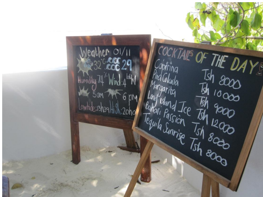
Typical daily circumstances at the beach: hot weather and cocktails are not only enjoyed by tourists, but by many of the inhabitants of the beach as well.

Food is another issue on which Zanzibari rely on outsiders in the tourist business. Although Zanzibari are very experienced preparing the 'traditional' kitchen, such as curries, octopus and lobster, 'Western food', such as pizzas, hamburgers and steaks is something different, and still quite new. The more fancy hotels and restaurants have an outside food and beverage manager, or even an outside chef, that teaches Zanzibari cooks how to prepare what tourists wish for. Furthermore, more and more foreign products are imported to Zanzibar. For instance French cheese, Kenyan steak, Spanish wine and delicatessen are being imported from the outside, by outsiders, in order to please outsiders. When it comes to taste, outsiders know what outsiders want, and this is why they are crucial for the success of tourist businesses in the southeast.