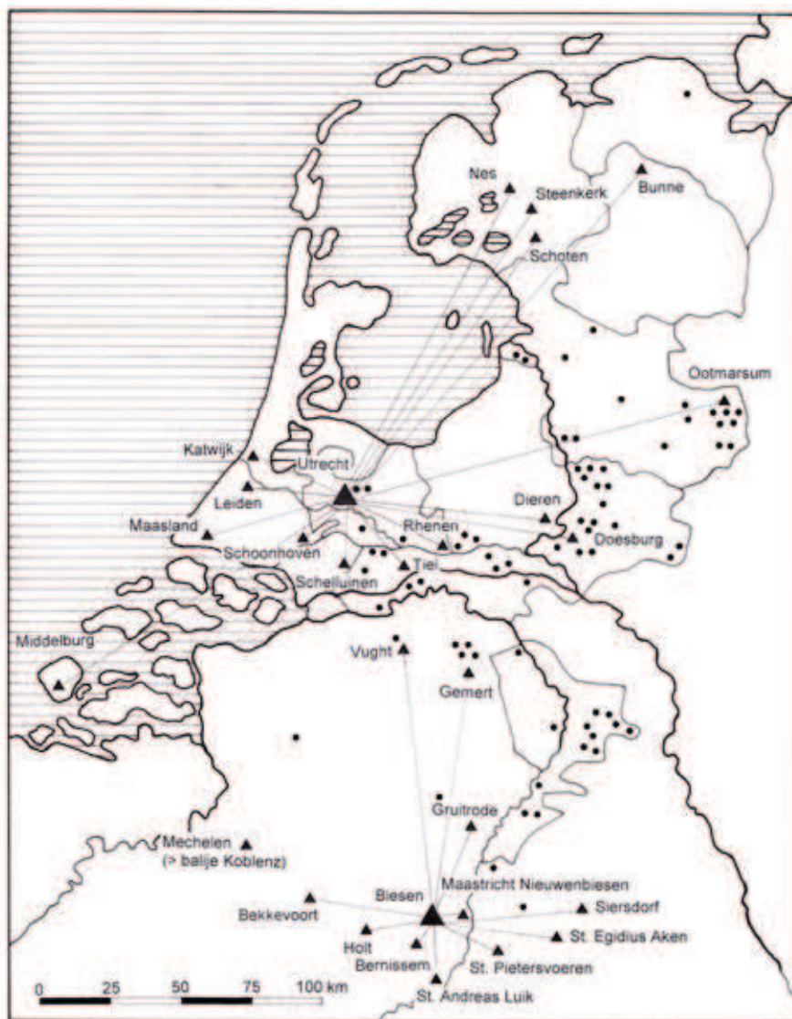
Map: The regional origin of the 'Dutch' brethren in the Livonian branch of the Teutonic Order (1300-1562)