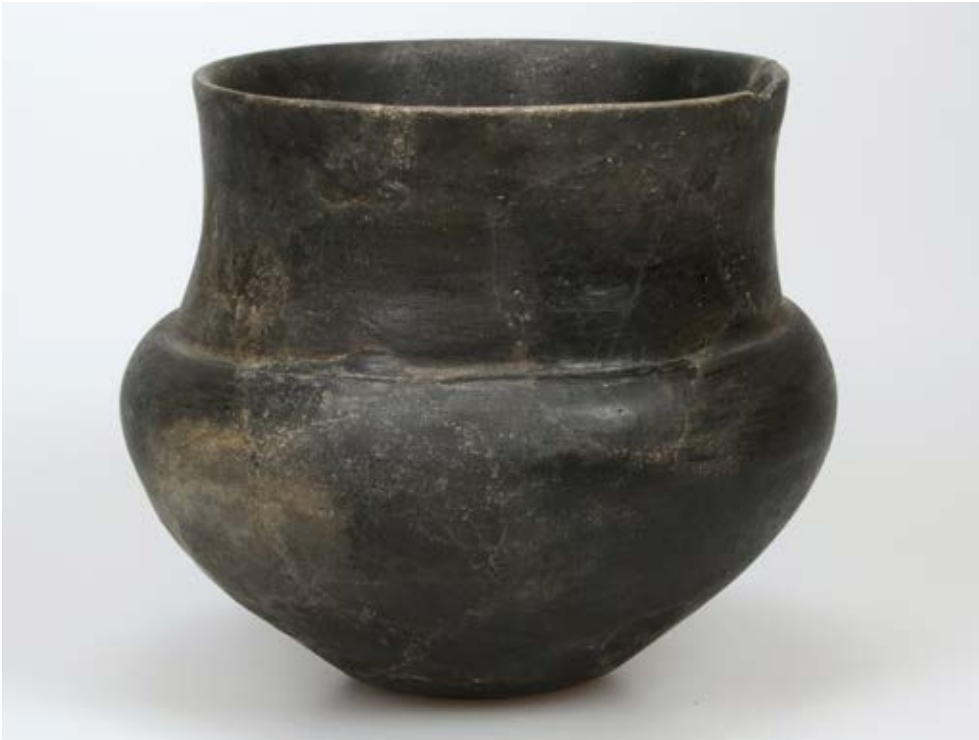
Figure 12.1 Although dates on charred food crusts are problematic (due to the reservoir effect), it is one of the very few possibilities to get a grip on the absolute chronology of the site. A sample of a food crust on this vessel (no 30) was taken for ^{14}\text{C} analysis (GrA-56013), resulting in 4030 \pm \text{BP} , which corresponds to Furholt phase D.

and Mienakker. On typo-chronological grounds, the habitation at Zeewijk-East and in the northern part of Zeewijk-West can be seen as the earliest – possibly contemporaneous – phase, whereas the south part of Zeewijk-West is the latest. In this sequence, the construction of the large structure at Zeewijk-East, cutting through numerous ard marks and the tearing down of the exterior posts of this building and reuse of the wood from these wall posts might have been the final acts on the eastern side of the gully. Habitation in the south part of Zeewijk-West continued, while the area of Zeewijk-East was used for other activities or may have been abandoned. The central posts of the large structure remained in the ground, still visible for some time after.