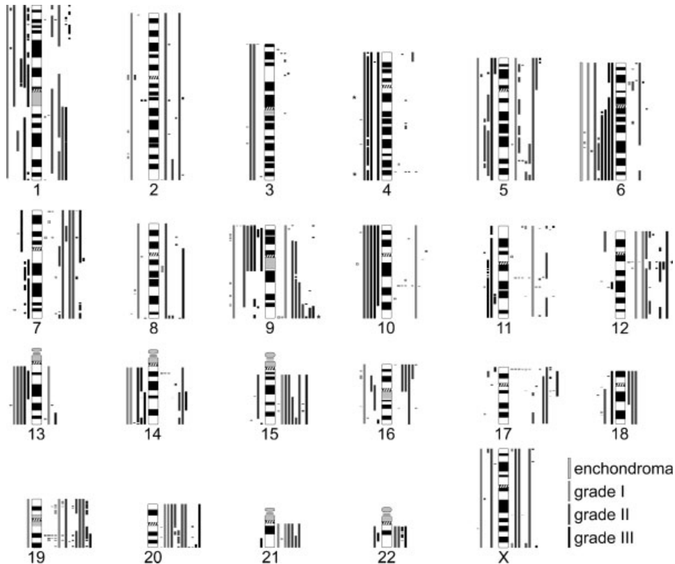
FIGURE 1. Genomic alterations were identified in enchondromas and in conventional central chondrosarcomas. These ideograms show the distribution of numerical aberrations subdivided into enchondroma and the 3 different grades of chondrosarcoma. Gains are shown on the right, and losses are shown on the left. Gain of chromosomal region 12q12 is associated with grade III chondrosarcomas. Polymorphisms have been left out of this figure, except if they were seen as only loss or gain in the tumors (for instance, 17p). Loss of chromosomes 10, 4q13, and 4q34.3 and gain of 9q34 are associated with adverse prognosis. Asterisks mark the locations of 4q13, 4q34.3, 9q34, and 12q12. (Chromosome ideograms were obtained from http://www.pathology.washington.edu/research/cytopages/ )