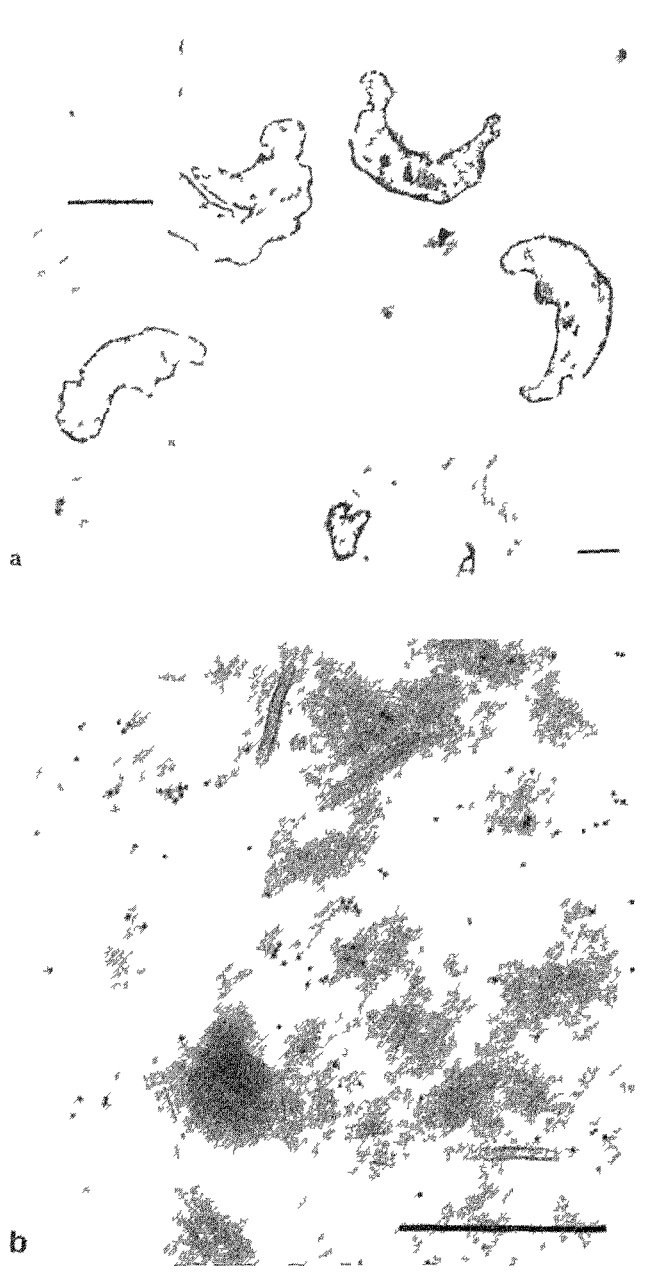
Figure 4 (a) Election micrographs of sorted CD1 positive cells showing LC with specific characteristics such as long cytoplasmic processes a lobulated nucleus and Birbeck granules (inset bar = 0.5 \,\mu\text{m} ) in the cytoplasm of the sorted CD1 positive cells Bai – 2 \,\mu\text{m} (b) Incubation of ultrathin cryosections with anti-HLA class II mAb (PdV5.2) conjugated to 10 nm colloidal gold particles<sup>24</sup> revealed a relatively high HLA class II expression on intracellular vesicular structures of the sorted LC Birbeck granules were negative B ir = 0.5 \,\mu\text{m}

HA 1 HA 2 HA 3 HA 4 and H Y are clearly recognized on peripheral blood DC