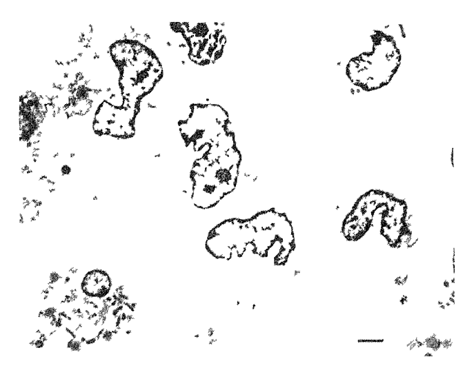
Figure 3 Electron micrograph of the sorted CD3 CD14 CD16 CD20 CD56 negative HLA DR positive cells showing the characteristics morphology of DC such as cytoplasmic processes and a lobulated nucleus Bar = 2 \mu m

Purified preparations of peripheral blood DC from six blood donors were analysed for expression of the mHag H Y and HA 1 HA 2 HA 3 and HA 4 and of the relevant restriction molecules HLA A2 and HLA A1 DC as well as PHA blasts and monocytes of each individual were assayed simul taneously as target cells with mHag and MHC class I specific CTL. The specific lysis percentages of the target cells from three of the six donors are depicted in Table 2. It is clear that DC were equally susceptible to lysis by the different CTL clones as the PHA blasts and monocytes of the same donor Thus analogous to PHA blasts and monocytes the mHag