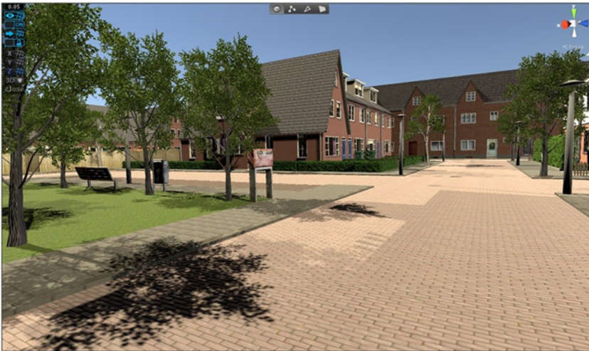
Fig. 2 a, b Impression of the virtual neighbourhood