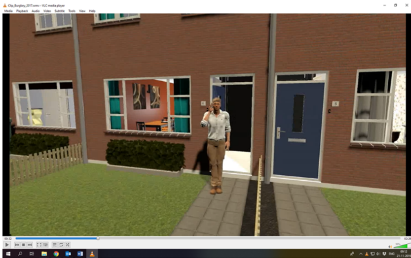
Fig. 3 Guardian in the virtual neighbourhood