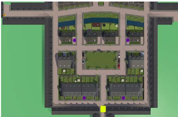
Fig. 1 Neighbourhood layout. The yellow square indicates the participant starting location; purple squares indicate the location where the guardian could appear