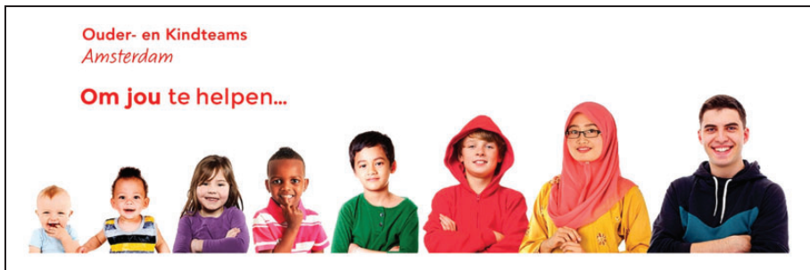
Figure 1. Parent and Child Team promotional material. ‘Parent and Child Teams Amsterdam. To help you...’.

Parent and Child Team protocol set out a model of interaction and course of action that started with a family’s own hulpvraag , their self-formulated request for assistance, and then proceeded to solicit parents’ diagnosis of the situation. In line with eigen kracht , strengths-based, principles, parents were then asked to come up with solutions that would outline their own role and resources. This client-centred perspective was thought to allow for tailor-made professional practices suitable to a diverse client population. However, the idea of a horizontal, cooperative relation between professionals and parents leaves little space for the existence of unbridgeable differences in opinion or conflicts between parents and professionals. When De Koning asked about such conflicts, some professionals argued that they worked in the interest of the child, which was assumed to be also the interest of parents, thereby ruling out the possibility of conflicting visions or professional error. This professional approach was also reflected in stock phrases that were part of professional jargon. De Koning frequently heard several professionals ask