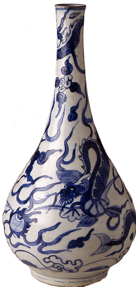
Blue and white bottle from de San Diego. H: 30 cm. Naval Museum, Madrid. Inv. n°. 7317