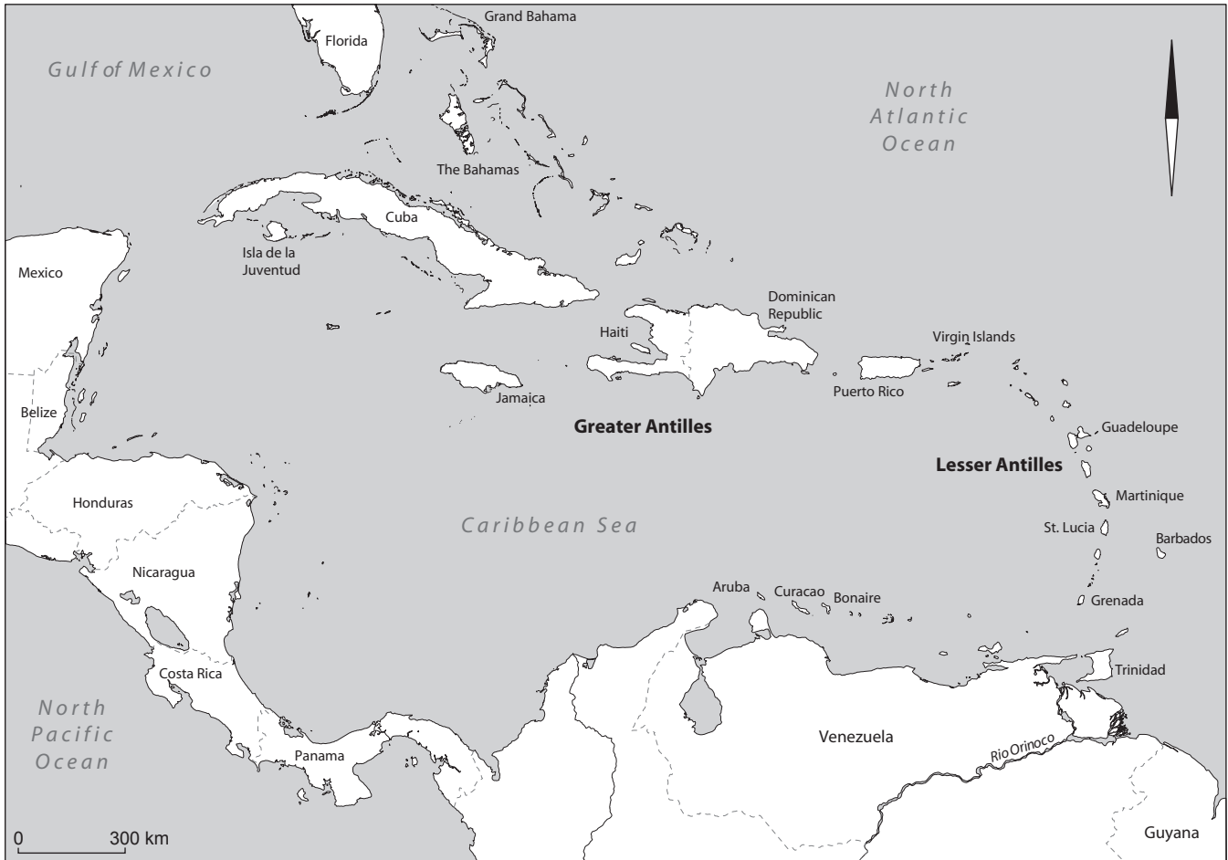
Figure 1.1. Map of the Caribbean.

communal activities, have status variation, but no centralized authority” (Siegel 1989, 202). Although burial differentiation and settlement hierarchy might be absent, they argue that the fast spread among the islands and relatively long uniformity in pottery decoration point to a society that was more complex than the tribal level (Hoogland 1996, 9). Thus, Boomert, as well as Hoogland and Siegel, stress the communal, connected character of Early Ceramic Age society, thereby contrasting it with the autonomous role that is usually attributed to villages in tribal societies (e.g., Carneiro 1998). Whether this communal character opened room for local village leaders to become regionally significant, in my opinion is not necessarily proven by the existence of a long-distance exchange network. Keegan et al. (1998) and Watters (1997a) argue that during first colonization this long-distance exchange network may have been crucial for the survival of different widespread villages in new environments. In this view, exchange functioned more as a means of bringing people together for purposes related to cooperation, rather than providing a platform for competing village leaders aiming at the acquisition of regional leadership.