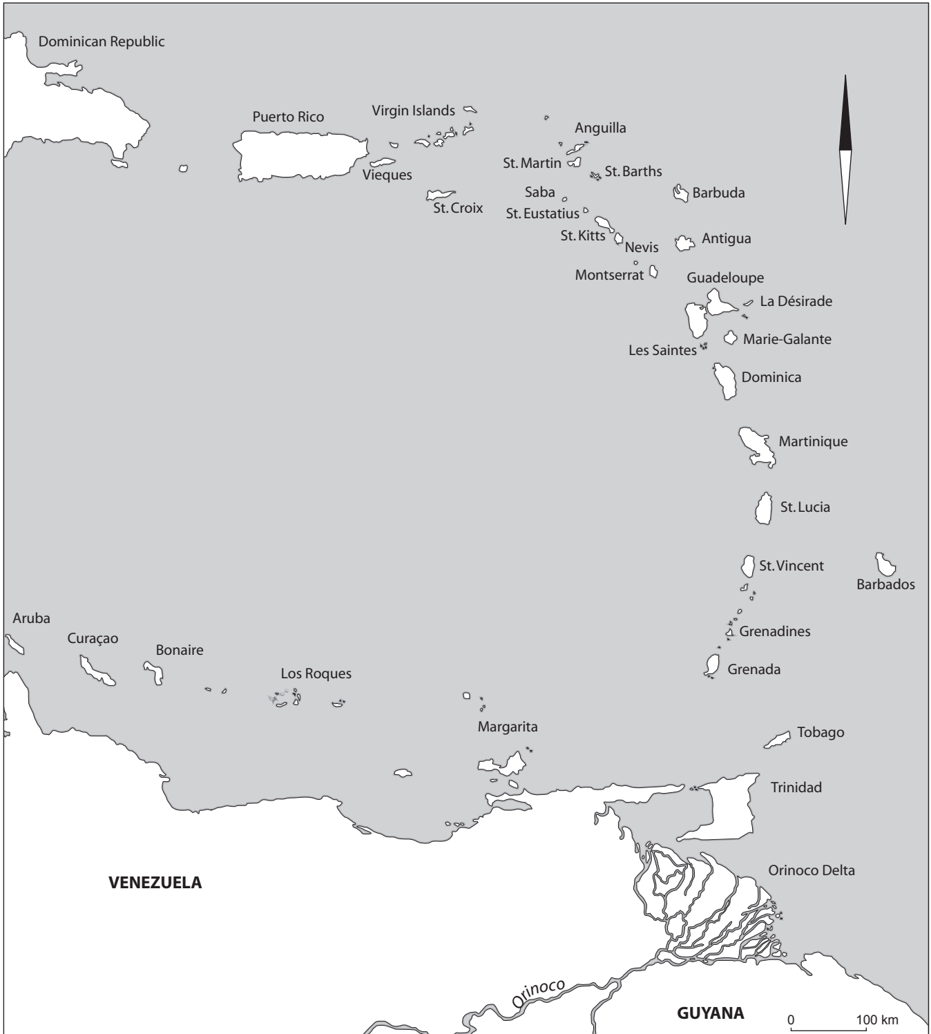
Figure 1.2. Map of the Lesser Antilles.