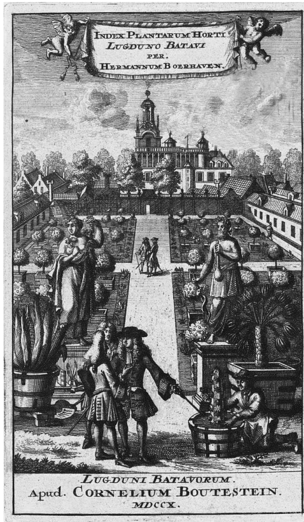
FIGURE 55. Hortus Academicus Lugduno-Batavus as depicted in the Index Plantarum Horti Lugduno Batavi (Boerhaave 1710). The chapel in the background is still part of the Hortus botanicus in Leiden today.

Note: —The short plant up to 1 cm tall, the suborbicular leaf with purple spots on the abaxial surface, the flexuous, successive racemose inflorescence with a single flower open at a time, the conspicuous thickening of the apex of the dorsal sepal, and the ligulate, unlobed, mostly inornate lip, which is shallowly depressed longitudinally in the middle places S. lugduno-batavae in the S. digitalis species group (Fig. 53). The few tiny flowers and short inflorescence are similar to that of S. pisinna (Fig. 54), a species known to occur in Mexico, Guatemala and Honduras. However, the new species can be distinguished by the prostrate habit (vs. erect habit), with shorter leaves, up to 8 mm long (vs. 11 mm), the flexuous inflorescence containing up to 6 flowers (vs. straight, containing up to 3 flowers), the creamy-white flowers (vs. heavily suffused and striped with purple) and the shorter lip (up to 1.6 vs. 2.3 mm). From the Mexican endemic S. digitalis , it can be distinguished by the smaller prostrate habit with shorter leaves, 4-8 mm long (vs. 12-15 mm) and shorter inflorescence (up to 2 vs 15 cm long) the ligulate to narrowly elliptic petals (vs. obovate). Specklinia succulenta from French Guyana is also similar, but the new species can be distinguished by the prostrate habit (vs. erect), the short inflorescence (up to 2 vs. 10 cm long), the whitish cream flowers (vs. greenish-yellow) and the immaculate lip (vs. a lip with two purple stripes).