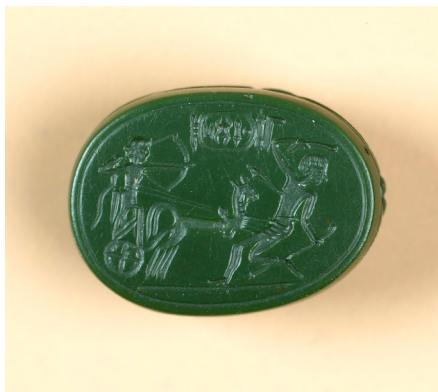
Fig. 1. Jasper scarab from the British Museum

"stiff". The famous "Aegean griffin" on the ceremonial axe from the Tomb of Queen Ahhotep, for example, is sometimes presented as an early example of the motif 10 but, with its back-paws firmly folded beneath its lower body, the figure exudes only a very limited sense of movement. From the Thutmosid period onwards, however, a true "flying gallop" appears relatively frequently in Egyptian art; often combined with additional elements, such as a shift in the axis of leaping animals, 11 that are most likely inspired by contemporary Aegean art. It is perhaps more than mere coincidence that the tomb of Rekhmire (TT 100; dating to the reign of Amenhotep II), which is famous for its procession of Aegean tribute bearers, also sports a magnificent mural of game being hunted in