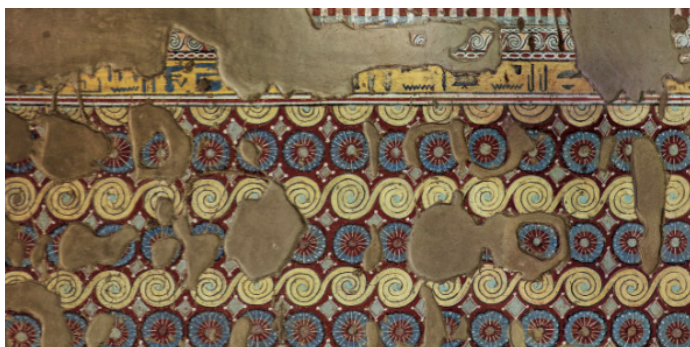
Fig. 10. Roof decoration in the chapel of Kha (photo IFAO, after Ferraris 2018)

more than coincidence that precisely at Deir el Medina, Aegean motifs appear at a remarkably early stage on locally-made pottery: Schiaparelli found fragments of two peculiar vessels, displaying Cypriot, Levantine and Egyptian elements and bearing the cartouche of Thutmose III, in the necropolis near the village, with a typical Aegean –running spiral– decoration. 27 It seems certain that Kha was aware of Pharaoh's interest in Aegean motifs (such as running spirals and bucrania) which were used to decorate temple furniture and a ceiling in a room of the royal palace at nearby Malqata, 28 for running spirals abound in Kha's own funerary chapel. Schiaparelli 29 already noted their presence on a section of the chapel's roof, but bands of running spirals are also present on the walls of the chapel (Fig.10). 30