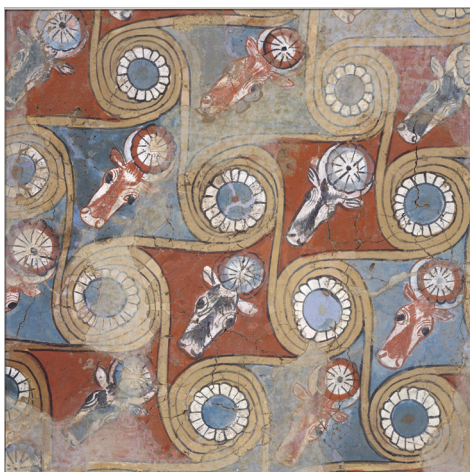
Fig. 9. Reconstructed ceiling at the palace of Malqata, with rosette and bucrania motifs