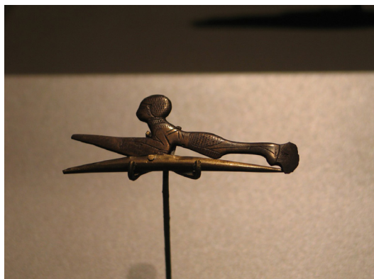
Fig. 4. A composite tool crowned by a figure of a woman, now in the Brooklyn Museum