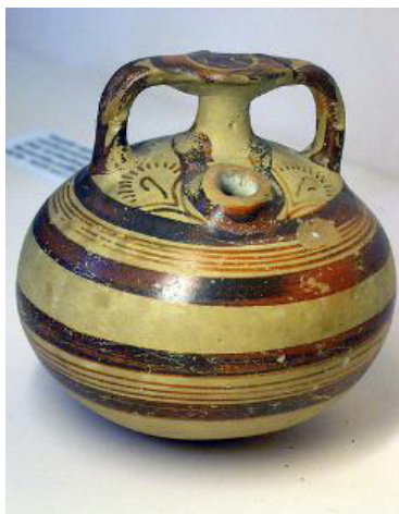
Fig. 8. Stirrup jar from the tomb of Kha, now in the Museo Egizio, Turin