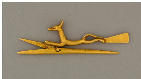
Fig. 3. A composite tool from the Metropolitan Museum of Art, New York

the late Thutmosid period; in particular the reign of Amenhotep III. Whilst it is virtually certain that the object was manufactured in Egypt, its iconography, as well as the context in which was found, suggest an Aegean pedigree for this peculiar object.