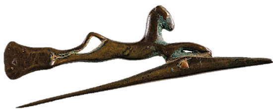
Fig. 2. A so-called composite tool from the tomb of Kha, topped by a figure of a horse in flying gallop, now in the Museo Egizio in Turin (after Ferraris 2018)

This short note proposes that a stylized horse on a bronze tool from the tomb of the architect Kha at Deir el Medina (Upper Egypt) (Fig. 2) may represent the first example of a horse in true "flying gallop" in Egypt. Moreover, it suggests that its appearance may be set against the backdrop of developing international contacts and exchange with the Mycenaean mainland in