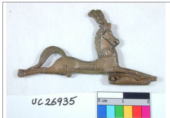
Fig. 5. A composite tool crowned in the collection of University College London (photo: UCL, UC 26935)

as made of "pure bronze". 13 Objects such as these are variously described as scissors (by Schiaparelli), tweezers or curling tongs, though they are probably best described as a "composite tool". 14 The composite tool from the tomb of Kha consists of two elongated bronze elements: one of these is a knife-like blade whereas the other, slightly convex, element is crowned with the figure of a galloping horse. These two elements are pegged together with a pin, which is visible just below the forelegs of the galloping horse. It is thought that such composite tools could be used as a pair of tweezers and even as a sort of razor, whereas the flat end of the object may have been used as tongs. 15 Objects such as these were made in Egypt since the 6th dynasty (though the addition of zoomorphic figure seems to have been a New Kingdom innovation), and various gold and numerous bronze examples are known. To that extent, the object from the Tomb of