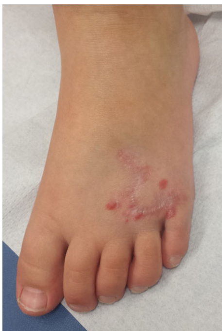
Figure 2 Recurrence of many papules in and close to the excision scar.