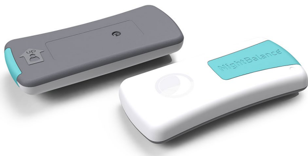
Fig. 1 Sleep position trainer

Secondary outcomes were the severity of snoring and satisfaction using the SPT. To evaluate the severity of snoring, a numeric visual analogue scale (VAS) containing a score between 1 (no snoring) and 10 (severe snoring) was filled out by the bed partners, at baseline and after 6 week of using the SPT. The study subjects were asked a dichotomous question (containing yes or no) about satisfaction using the SPT for a period of 6 weeks. Furthermore, according to the study by Lee et al. response profiles were determined; VAS \leq 3 post-treatment was defined as 'major response' and post-treatment VAS \leq 5 plus SOS \geq 60 defined as 'fine response' [31].