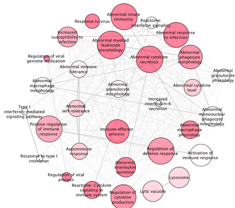
Figure 1. Upregulated pathways in HD versus control blood. Schematic representation of pathways collated from publicly available databases that are significantly upregulated in HD versus controls after correction for multiple testing ( q < 0.05 ). Modules with similar gene content and functional annotation have been consolidated. Nodal shading is inversely proportional to false discovery rate threshold ( q value); deep shades have low q values and pale shading is close to the 5% threshold. The weight of connecting lines is proportional to the number of genes shared between pathways.