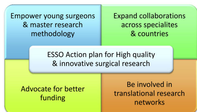
Fig. 2. ESSO's for pillars of action for improving clinical research in surgery.