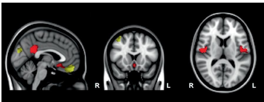
Figure 1. Regional grey matter changes in PD patients. Red: Reduced grey matter in the posterior cingulate network related to cognitive impairment. Yellow: Reduced grey matter in the anterior cingulate network related to excessive daytime sleepiness. Images are overlaid on the most informative sagittal, coronal and transversal slices of the MNI (Montreal Neurological Institute) standard anatomical image (MNI coordinates are -2, 18, 12). Results with a threshold-free cluster enhancement (TFCE)-familywise error (FWE) corrected p -value < 0.05 and a voxel size above 30 are shown.

atrophied, voxel-based analysis within the posterior and anterior cingulate network was performed. We used the domain score of cognitive impairment to examine decreased grey matter in the posterior cingulate network and excessive daytime sleepiness to examine decreased grey matter in the anterior cingulate network, as is shown in figure 1. Large clusters of grey matter volume reductions in the posterior cingulate network related to cognitive impairment were localized in the posterior cingulate cortex ( p = 0.002 , peak cluster MNI coordinates: 0, -52, 24, voxel size = 509) and the central operculum cortex ( p < 0.001 , peak cluster MNI coordinates: 54, -2, 4, voxel size = 786). Smaller clusters of decreased grey matter were found in the subcallosal cortex ( p = 0.015 , peak cluster MNI coordinates: 0, 16, -12, voxel size = 103), the parietal operculum cortex ( p = 0.046 , peak cluster MNI coordinates: 38, -22, 18, voxel size = 21) and the posterior middle temporal gyrus ( p = 0.020 , peak cluster MNI coordinates: -58, -34, -10, voxel size = 28). In the anterior cingulate network, decreased grey matter related to excessive daytime sleepiness was found in the middle frontal gyrus ( p = 0.014 , peak cluster MNI coordinates: 36, 16, 48, voxel size = 191), the frontal medial cortex ( p = 0.007 , peak cluster MNI coordinates: -4, 52, -20, voxel size = 252) and the cuneus ( p = 0.013 , peak cluster MNI coordinates: 2, -86, 18, voxel size = 178).