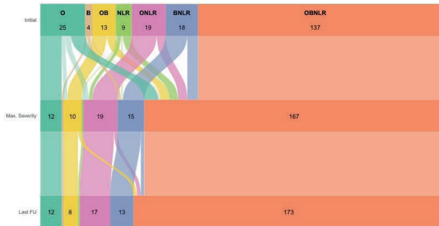
Figure 3. Cumulative phenotypes and shifts over time

Abbreviations: O = ocular, B = bulbar, OB = oculobulbar, NLR = neck/limbs/respiratory, ONLR = O+NLR, BNLR = B+NLR, OBNLR = O + B + NLR, Baseline = initial weakness during the first six months from the onset of MG, Max. Severity = time of maximum severity, Last FU = last three months