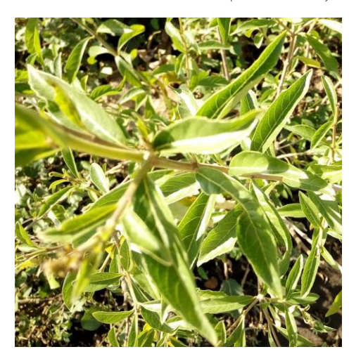
No. 8: Omosese (Rotheca myricoides)