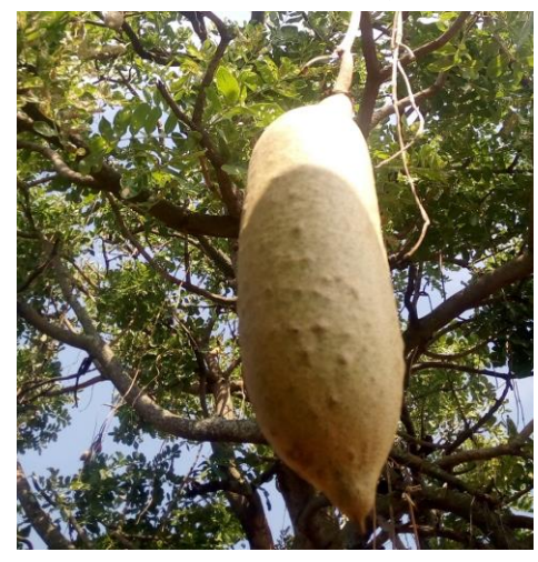
No. 10: Umuribha (Kigelia africana)