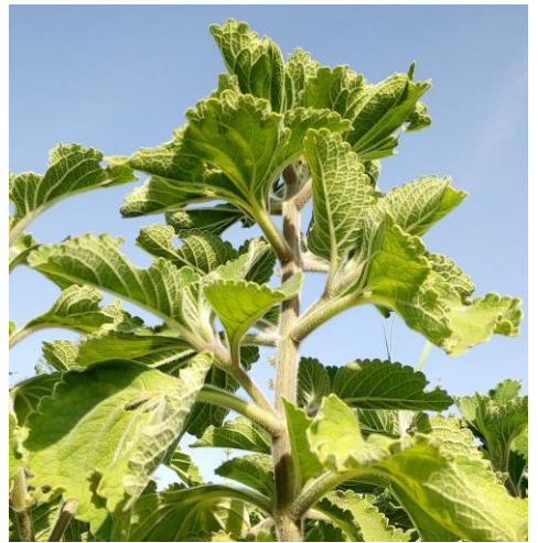
No. 9: Iririrebhana (Plectranthus barbatus)