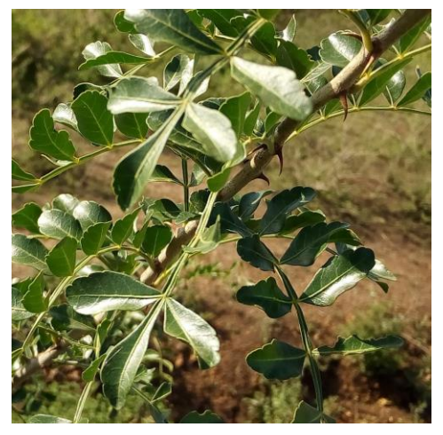
No. 3: Urung'uno (Harrisonia abyssinica)