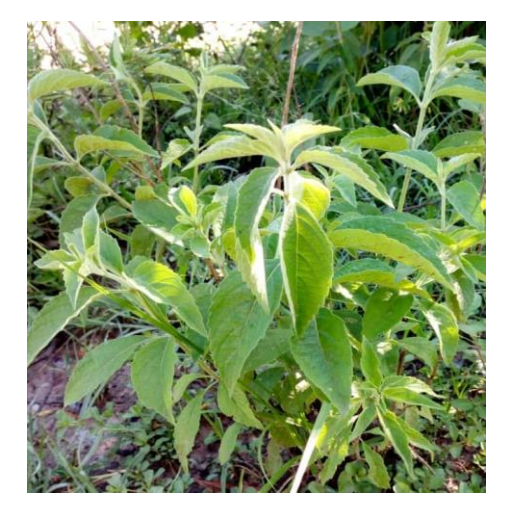
No. 13 Omohenga (Hoslundia opposita)