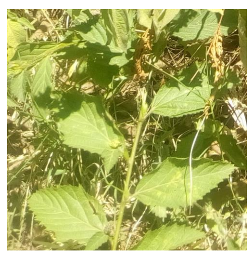
No.5: Ikiiri (Ocimum gratissimum)