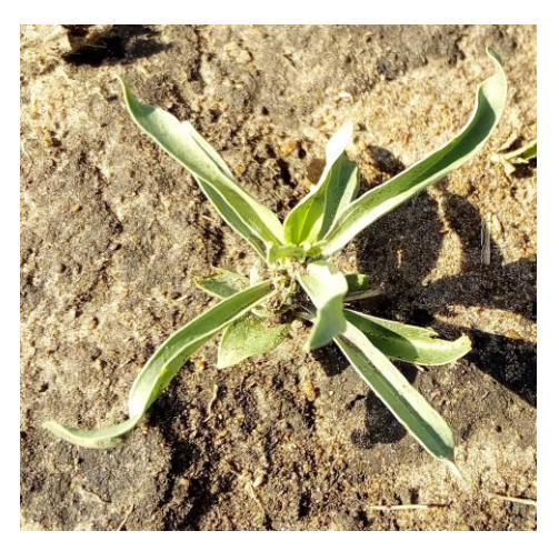
No. 4: Ubhoke Bweitimo (Lamiaceae)