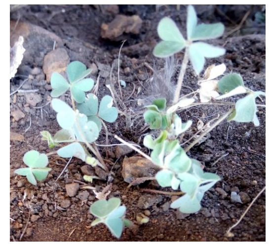
No. 14 Kinyonyo (Oxalis corniculata)