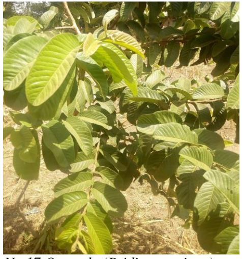
No.17 Omupela (Psidium guajava)