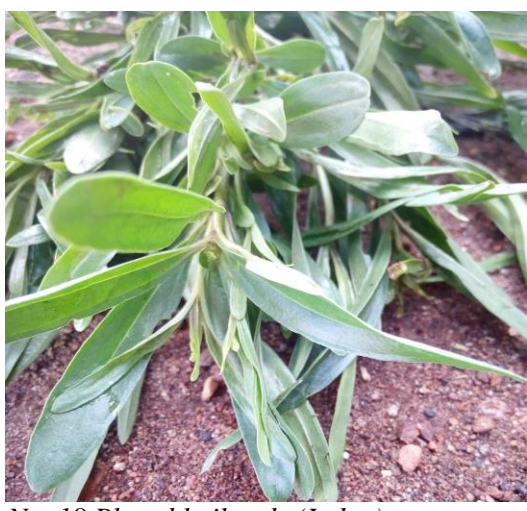
No. 18 Bhurubhoikonde (Indet.)