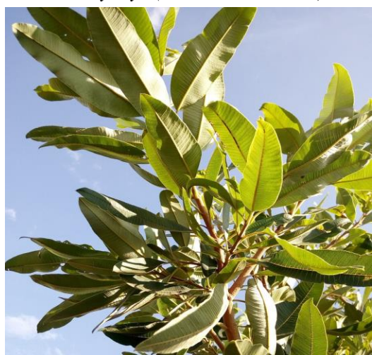
No. 16 Mchele (Ozoroa insignis)