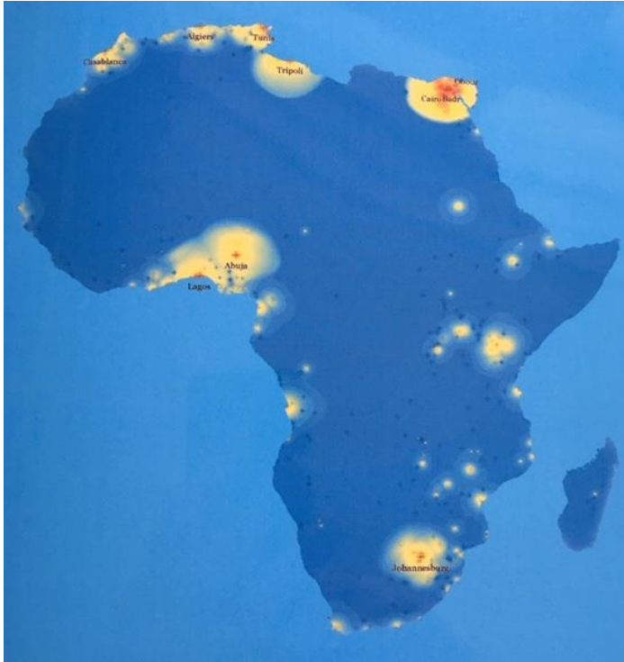
Map 1. Africa's economic hubs