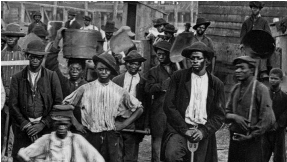
Figure 25: Laborers at a Wharf in Virginia, 1863 701

Especially in the 1850s, the constant complaints by employers about labor shortages made dissatisfaction visible. This did not necessarily mean that there were not sufficient workers, as Barbara Fields and Seth Rockman agree, but rather that the wages were considered to be too high, the term of service too short, or that employers could not afford to hire and fire people at will. In essence, it meant that employees retained limited power to bargain about working conditions. 699 The complaints about them show that workers in the sense of free capitalist markets were not desired at most times. Rather, employers had an intrinsic interest in commanding a work force confined in power. Racism among the lower classes was a welcome tool to keep the competition going and even Irish and German laborers were at times pitted against each other. As a result, for example, wages fell from $1.25 to 87.5 cents a day at the Chesapeake & Ohio Canal in 1839. 700