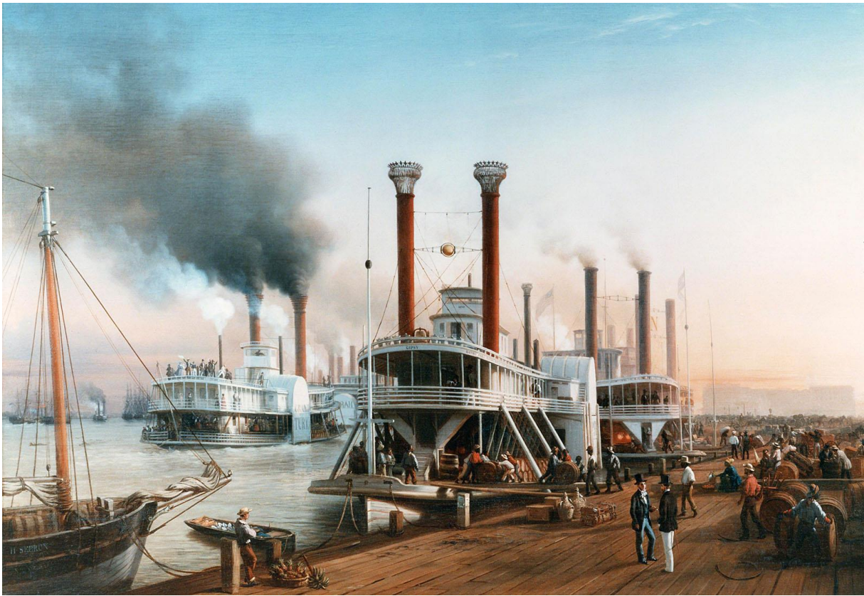
Figure 19: Dock Work in New Orleans, 1853 585

dilative labor allowed employers to hire and fire workers on short notice, according to their every-day needs. Dock workers and those loading and unloading ships, for instance, could be hired the minute a vessel got into the port.