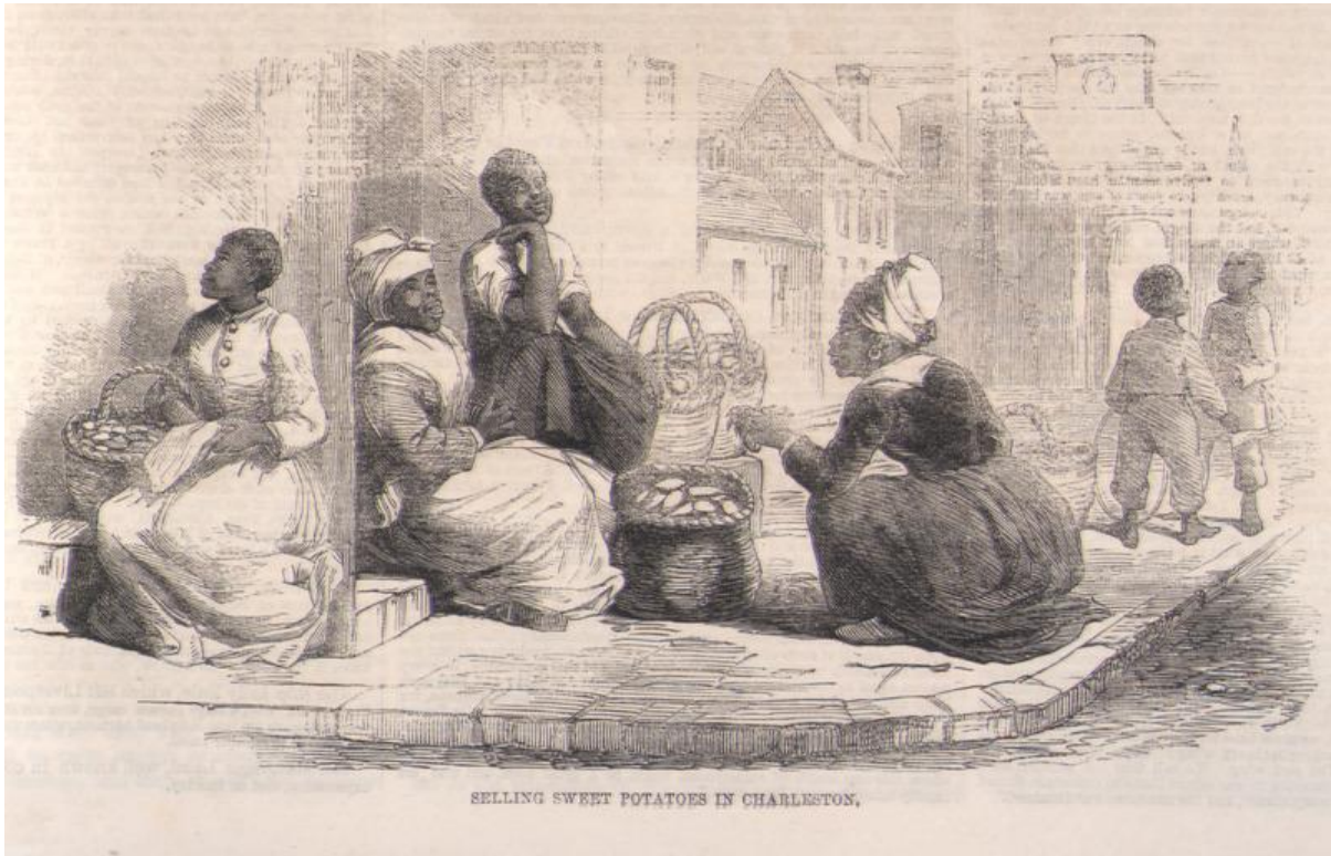
Figure 21: Self-hired Bondswomen Selling Sweet Potatoes in Charleston 637