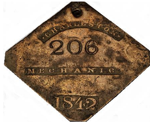
Figure 23: Slave Badge of a Mechanic, 1842 646