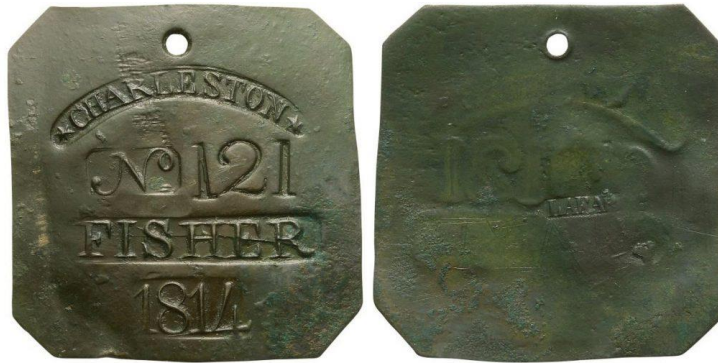
Figure 24: Slave Badge of a Fisher, 1814 647

In theory, tickets for hired slaves were not a sufficient identification in Charleston. Municipal ordinances inform that slaveowners were from 1800 onwards required by law to purchase badges given out by the treasurer of the city, who kept a register of all the slaves who obtained badges. Legislation was rather strict stipulating slaves to wear these badges on visible parts of the body and employers had the duty to demand to see them. If an employer was caught hiring a slave who did not possess a badge, he had to pay a $5 fine plus the wages he had agreed upon with the slave's owner. 648 The feasibility of this ordinance was questionable from the very