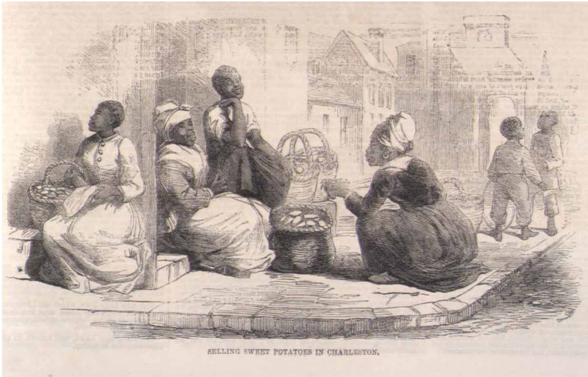
Figure 21: Self-hired Bondswomen Selling Sweet Potatoes in Charleston 637