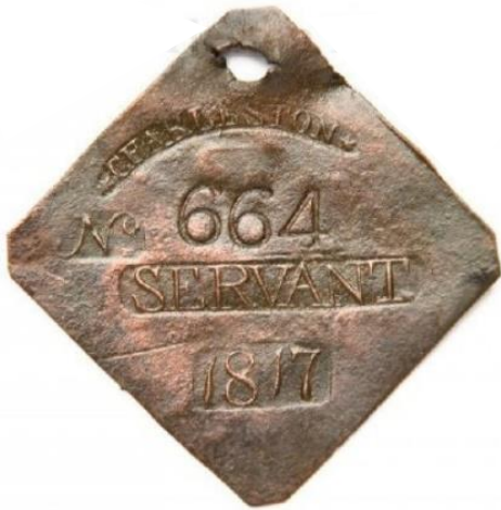
Figure 22: Slave Badge of a Servant, 1817 645