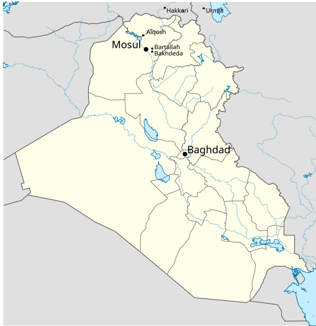
Figure 1.1: Map of Iraq, based on “Location map of Iraq” ( https://commons.wikimedia.org/wiki/File:Iraq_location_map.svg , by user NordNordWest – CC BY-SA 3.0

process, as we see further on in this dissertation. 6 That is not to say that the authorities ruling Iraq, British and local, did not have difficulties with developing their state identity. The Kurdish revolts and the Simele massacre of 1933 are good examples where the state failed to keep everybody on board. In this section, I show the different phases of state formation Iraq went through from the end of Ottoman rule to the revolution of 1958, as it formulated its identity as an Arab, and later