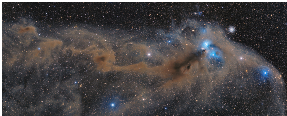
Figure 6.12: View of the dust component of the clouds in the Corona Australis star forming region. The denser clouds effectively block light from more distant background stars in the Milky Way.