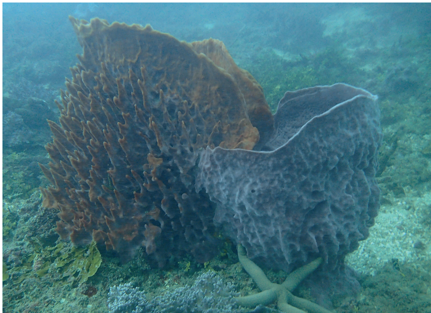
Figure 3.1. Two merged individuals of giant barrel sponge species ( Xestospongia spp.) with distinct color morphologies in Tanzania.

In addition, two individuals with different genetic identities were observed growing against each other, and at the contact zone, the color of the purple sponge diffused into the bronze sponge (Fig. 3.1). The color of sponges is often derived by the composition of the associated microbiota (Blanquer et al. 2011). It is, therefore, not clear whether this blended area is the result of the exchange of hybridizing sponge cells or an exchange of microsymbionts.