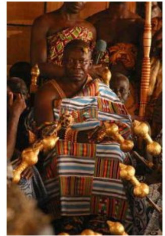
Figure 1: The Asante King is believed to be sacred, because he mediates between the living and spiritual beings. He is, therefore, not allowed to touch the ground with his bare feet [1]

Among other factors that are important in terms of their identity are the language they speak (Twi), their cultural customs, and the land on which they are born. Asante call themselves as such because their parents and ancestors are