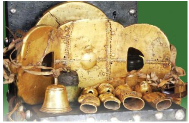
Figure 3: The Sika Dwa Kofi: the golden stool of the Asante, which is believed to contain the communal soul ( sunsum ) of all Asante and is the source of a chief's political power [3]

multitude, with the help of his supernatural power, stated to have brought down from the sky, in a black cloud, and amid rumblings, and in air thick with white dust, a wooden stool with three supports and partly covered with gold. This stool did not fall to earth but alighted slowly upon Osei Tutu's knees. There were, according to some authorities, two brass bells on the stool when it first came from above. According to others, Anotchi caused Osei Tutu to have four bells made, two of gold and two of brass, and to hang one on each side of the stool. Anotchi told Osei Tutu I and all the people that this stool contained the sunsum (soul or spirit) of the Asante nation, and that their power, their health, their bravery, their welfare were in this stool. To emphasise this fact, he caused the king and every Asante chief and all the queen mothers to take a few hairs from the head and pubes, and a piece of the nail from the forefinger. These were made into a powder and mixed with 'medicine'. Some was drunk and some poured or smeared on the stool. Anotchi told the Ashante that if this stool was taken or destroyed, then, just as a man sickens and dies whose sunsum during life has wandered away or has been injured by some other sunsum , so would the Asante nation sicken and lose its vitality and power (Rattray 1923:289-290).