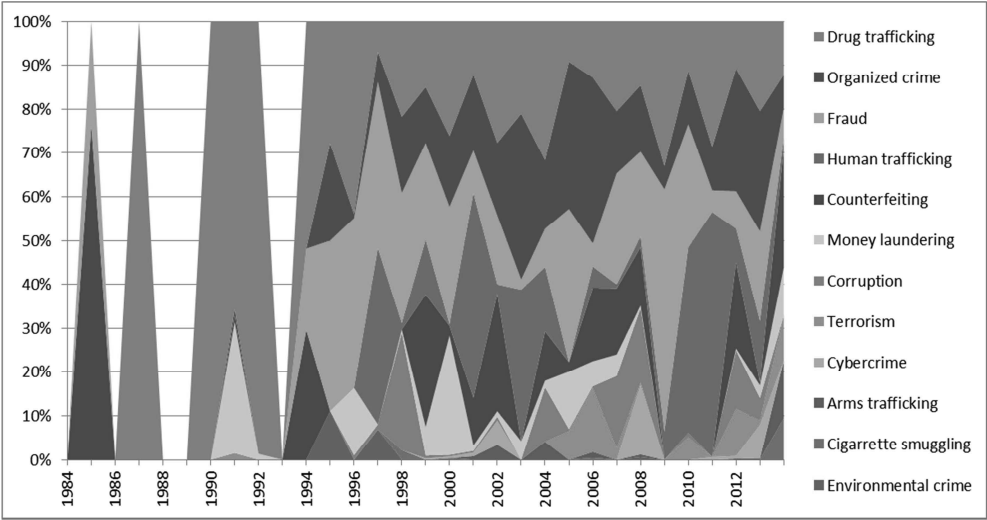
Figure B. Allocation of attention across all OC issues on the Commission agenda