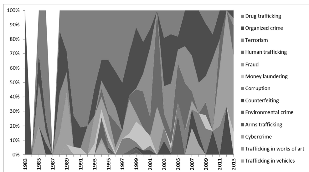
Figure A. Allocation of attention across all OC issues on the European Council agenda

The issues are presented in the order they appear in the codebook on OC issues (see Appendix 2), not ranked.