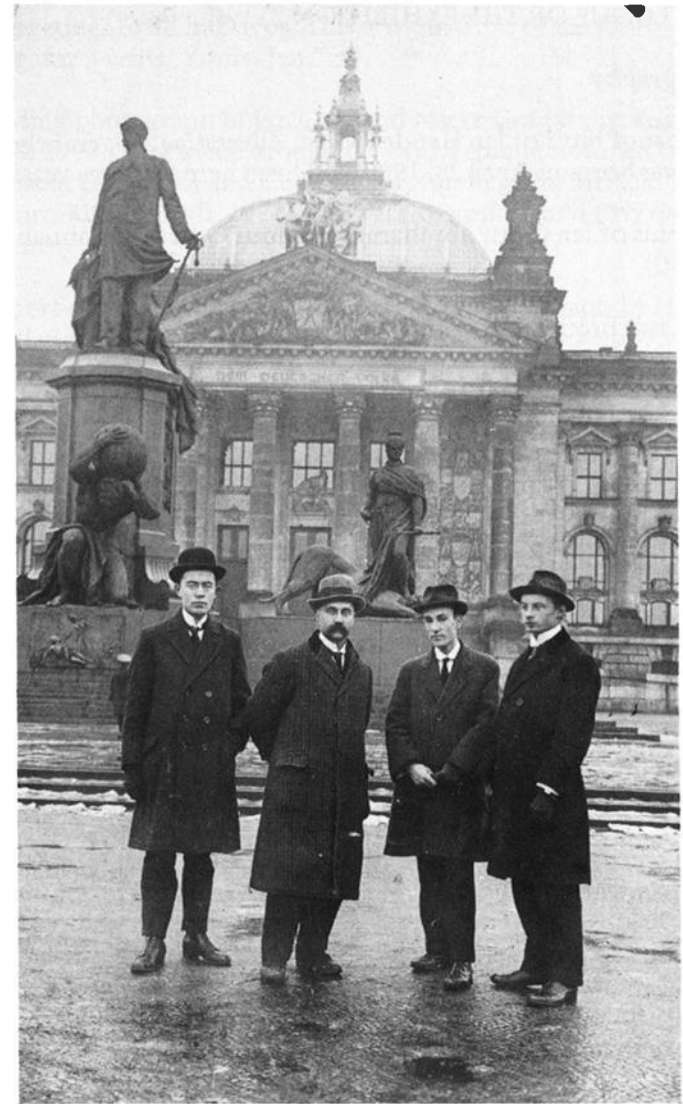
Visit to Berlin (1919). J.H. Oort the second from right, with friends, standing before the Reichstag. Postcard.