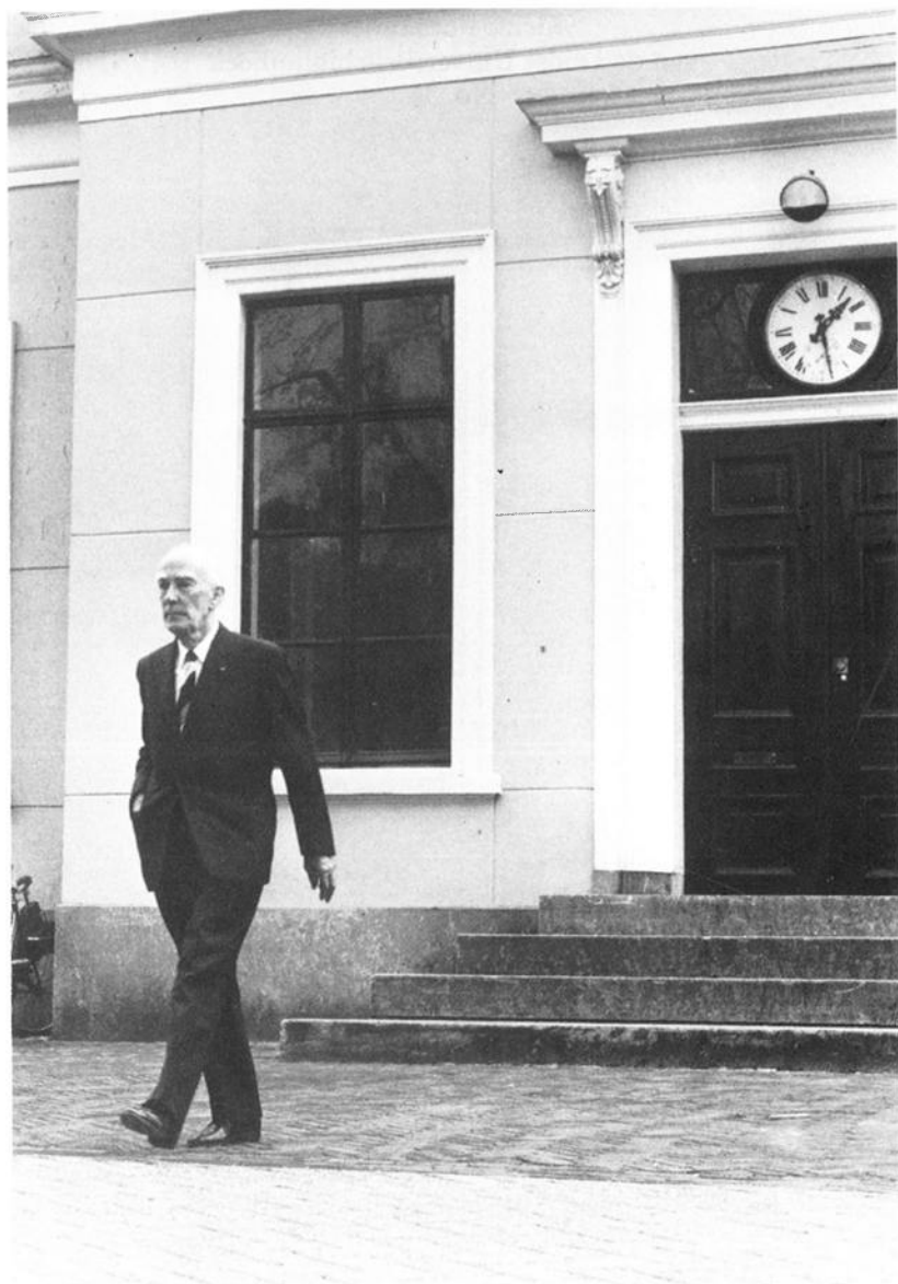
J.H. Oort, in front of the former Leiden Observatory (1976)