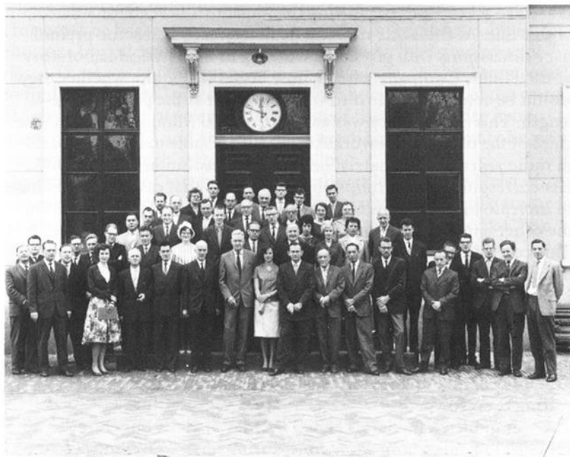
Staff of the Leiden Observatory in 1960. See catalogue No. 12 for an identification of most persons on this photograph.

because of the condition of the observatory staff. As mentioned before, the people were badly undernourished, and at first working hours were confined to the mornings. These were gradually extended, as more food became available and people got stronger 10 . Oort took some steps to reinforce the sense of cohesion of the Observatory staff. One important step was that he instituted communal coffee sessions at 11.00 a.m. To get these going he used real coffee that had been sent to him from the USA, as the Netherlands were still stuck with ersatz. The Observatory coffee break quickly grew into a tradition, combining a sense of community with efficiency. Those who ever spent some time at Leiden Observatory during Oort's directorate will remember staff members queuing up during coffee to have a quick word with Oort on minor points, or to make an appointment for more important discussions.