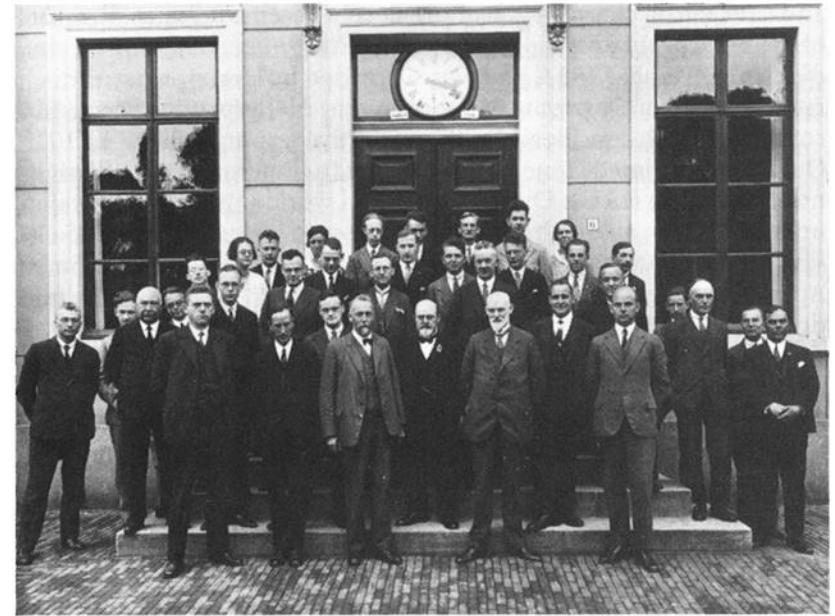
Staff of the Leiden Observatory in 1933. See Catalogue No. 11 for an identification of the persons.

Oort was increasingly called upon to take on official functions. After Oort's return from Perkins, De Sitter left for a half-year's sabbatical,