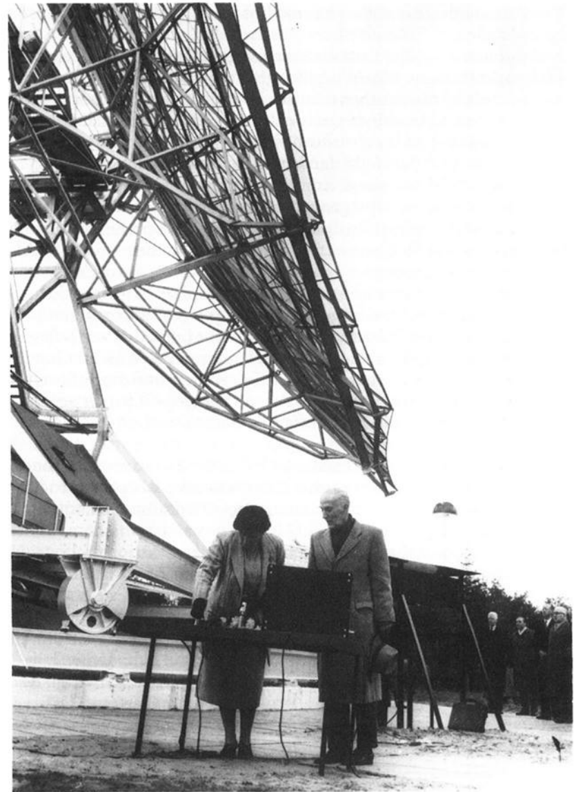
Official opening in 1956 of the 25-m Dwingeloo telescope by H.M. Queen Juliana, J.H. Oort explaining.