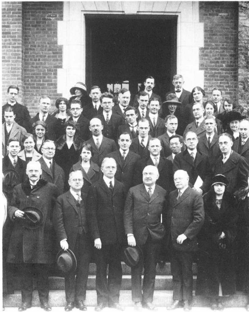
J.H. Oort as a young researcher, at a meeting of the American Astronomical Society, Poughkeepsie, N.Y., Vassar College, December 1923. Oort is standing in the centre, on the one but last row .

because when Oort had been in New Haven for about a year, he was offered the opportunity to go to the Southern Station of Yale Observatory that was to be built in Johannesburg. Oort hesitated. He may have seen it as some sort of exile, and he wrote to his senior colleagues (De Sitter and Van Rhijn; Kapteyn had died in 1921) in the Netherlands to discuss the offer with them.