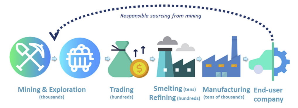
Fig. 1. Responsible sourcing by the end-user company from mining. Icons are from FlatIcon (2019), numbers of companies in the supply chain from Philips (2019).