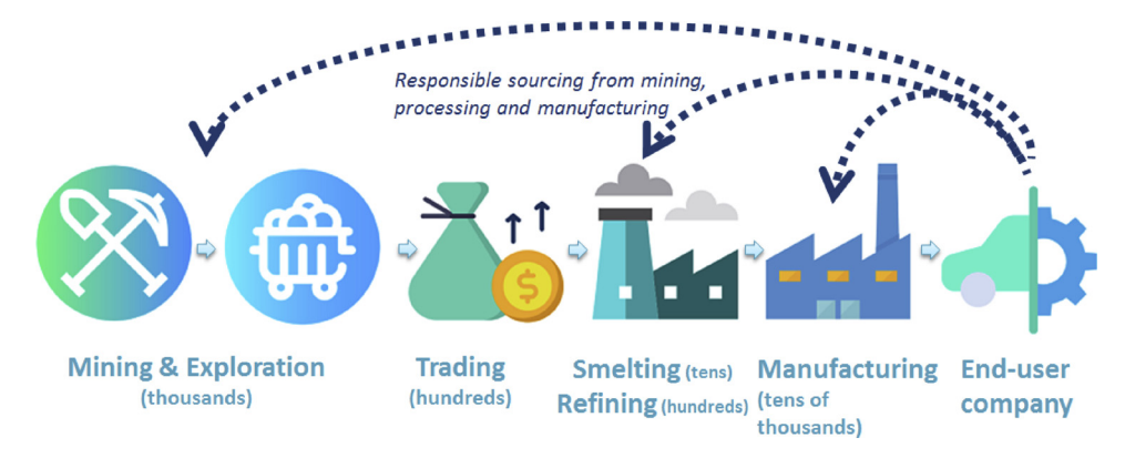
Fig. 2. Responsible sourcing by the end-user company from mining, processing and manufacturing. Icons are from FlatIcon (2019), numbers of companies in the supply chain from Philips (2019).

but it is noted that supplements on other minerals may be added to the guidance in the future (OECD, 2016). At the latest OECD Forum on Responsible Mineral Supply Chains, there were discussions on adding cobalt and mica (OECD, 2018).