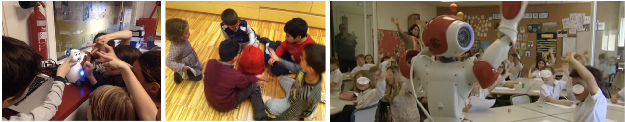
Figure 1: From left to right, a) the robot can have the function of social agent, b) robot as a playful tool, and c) robot as a coach.