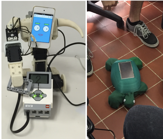
Figure 2: Different robots built in-house for cognitive therapies, including TBI and autism.

and after the injury, however, TBI sufferers encounter the need to develop and the acquire new cognitive functions, which is crucial in young populations [17].