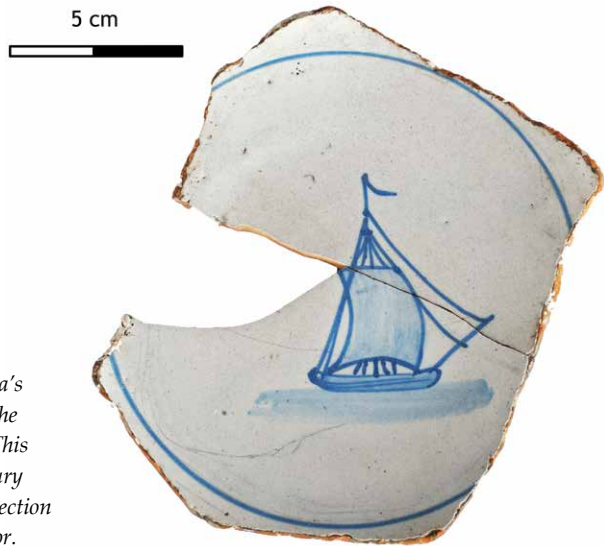
Figure 1.3 Many artifacts in Statia's archaeological record underscore the island's connection with the sea. This maritime-themed eighteenth-century faience plate from the SECAR collection is one example.