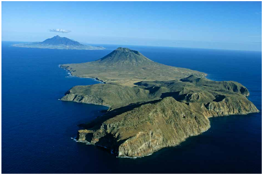
Figure 1.1 Aerial image of St. Eustatius, looking south. The Northern Hills are in the foreground, behind which is the Quill. The island in the background, only 13 kilometers south of St. Eustatius, is St. Kitts.