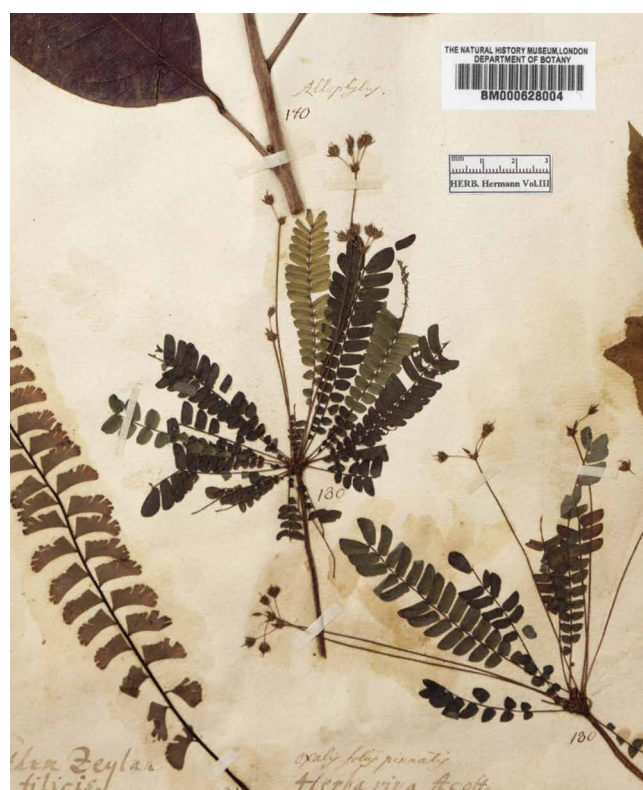
Fig. 9 Specimens of Biophytum hermanni in the Hermann collection in London, Vol. 3, page 54 (BM000628004).