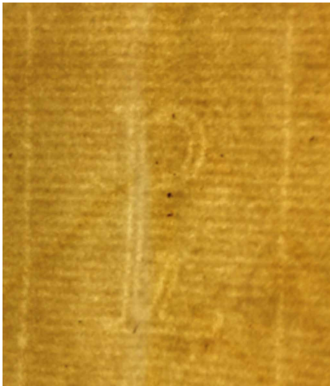
Appendix 1 Watermark with the initials 'PvL', present in c. 25 % of the pages in Volume II of the Leiden Hermann Herbarium. Most of the pages have no watermark.