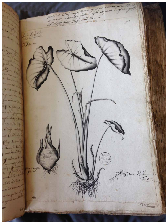
Fig. 2 Original drawing of Colocasia esculenta on plate 195a in Rumphius' manuscript BPL 314 (1692) at the Leiden University Library. The names 'keladi', 'Arum Aegyptium' and 'Caladium sativum' are visible in the upper left corner.

Arum' in his Herbarium Amboinense (1747: 313), among which is the sterile, domesticated tuber crop Caladium sativum (now Colocasia esculenta ). The original illustration of C. esculenta in Rumphius' manuscript BPL 314 is shown in Fig. 2.