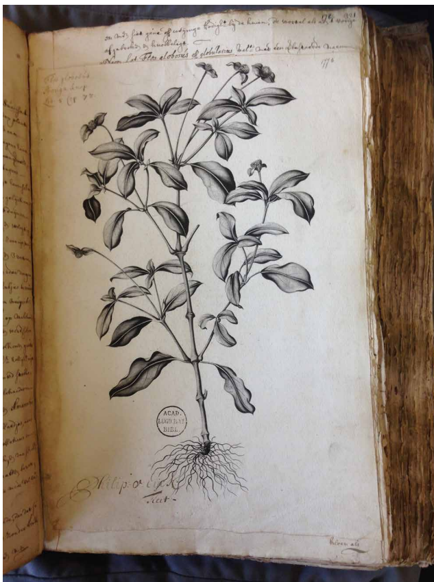
Fig. 5 Original drawing of Gomphrena globosa inserted between p. 320 and p. 321 in Rumphius' manuscript (BPL 314, 1692) in the Leiden University Library.

two specimens in Vol. 3, folio 54). These have, however, much longer peduncles and clearly pedicellate flowers (Fig. 9), while the L specimen has relatively shorter peduncles and subsessile flowers (Fig. 8). The illustrations in both the manuscript (Fig. 10) and the printed version of Herbarium Amboinense (Fig. 11) depict the same taxon as the Leiden specimen, B. sensitivum .