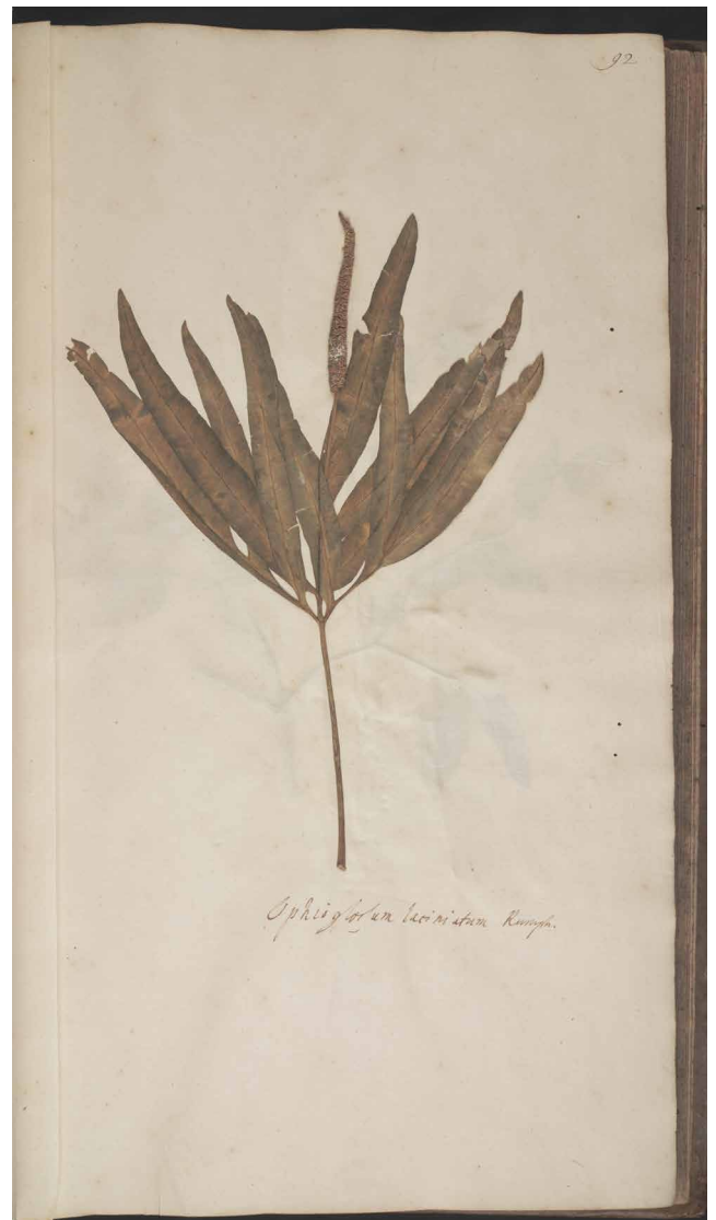
Fig. 6 Folio 92, Vol. II of the Hermann herbarium in Leiden. Helminthostachys zeylanica .

All BM specimens represent the Sri Lankan endemic B. hermanni Veldk., with the specimen depicted in Fig. 9 being the type (Veldkamp 1989), though Dassanayake in the Revised Flora of Ceylon (1999: 181), considered it to be B. reinwardtii (Zucc.) Klotzsch. Rumphius provided an extensive description of 'Herba sentiens' in 1685 and dedicated three pages on it in Herbarium Amboinense (1747: 301). He considered this plant a masterpiece of nature, as it leaves close at the slightest touch. Because of its characteristic behaviour, the plant was used in the Moluccas as a love charm, but in his long list of vernacular names, Rumphius did not mention the Sinhalese 'Nintikumba' or anything similar. Annotations on the BM collections refer to Herba viva (Acosta 1578) and Herba sentiens (Bontius 1658: 120), but not to Rumphius or a Sinhalese name. Apparently, when Hermann made these collections, he had not yet received the 'Rumphius' specimen of Biophytum sensitivum or read Rumphius' publication on the plant (1685). The Erfurt collection has one specimen identified by Rauschert (1970) as B. sensitivum , with the annotation 'Nintikumbu'. We requested a digital image and identified this specimen as B. hermanni . The Paris collection has a specimen (page 63) identified by Lourteig