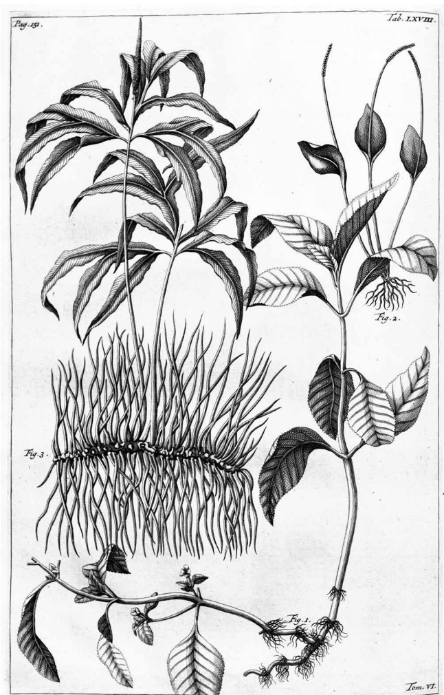
Fig. 7 Illustration of Helminthostachys zeylanica from the printed version of the Herbarium Amboinense (Rumphius 1750: 152).