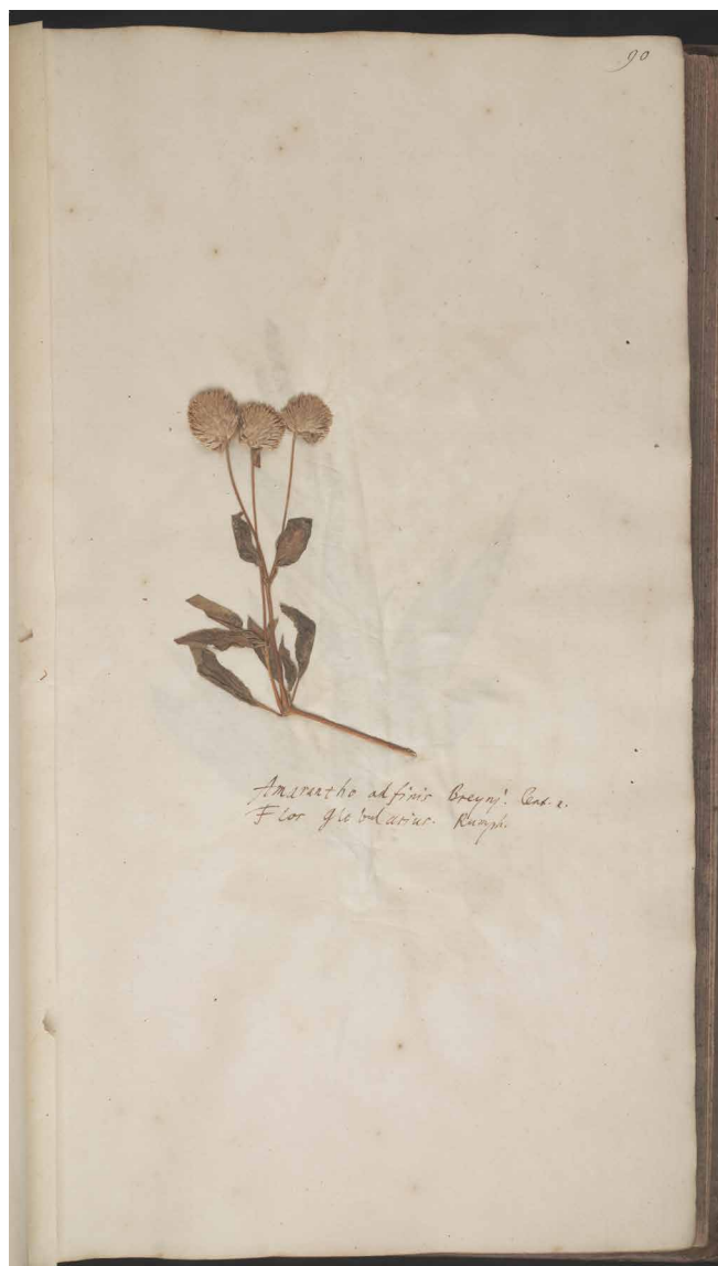
Fig. 3 Folio 90, Vol. II of the Hermann herbarium in Leiden. Gomphrena globosa .

Folio 92 bears a specimen of the fern Helminthostachys zeylanica (L.) Hook. ( Ophioglossaceae ) annotated by Hermann as 'Ophioglossum laciniatum Rumph.' (Fig. 6). This fern occurs in South-East Asia and Australia (Bharali et al. 2017). Linnaeus' description in the Flora Zeylanica (Linnaeus 1747: 178) is