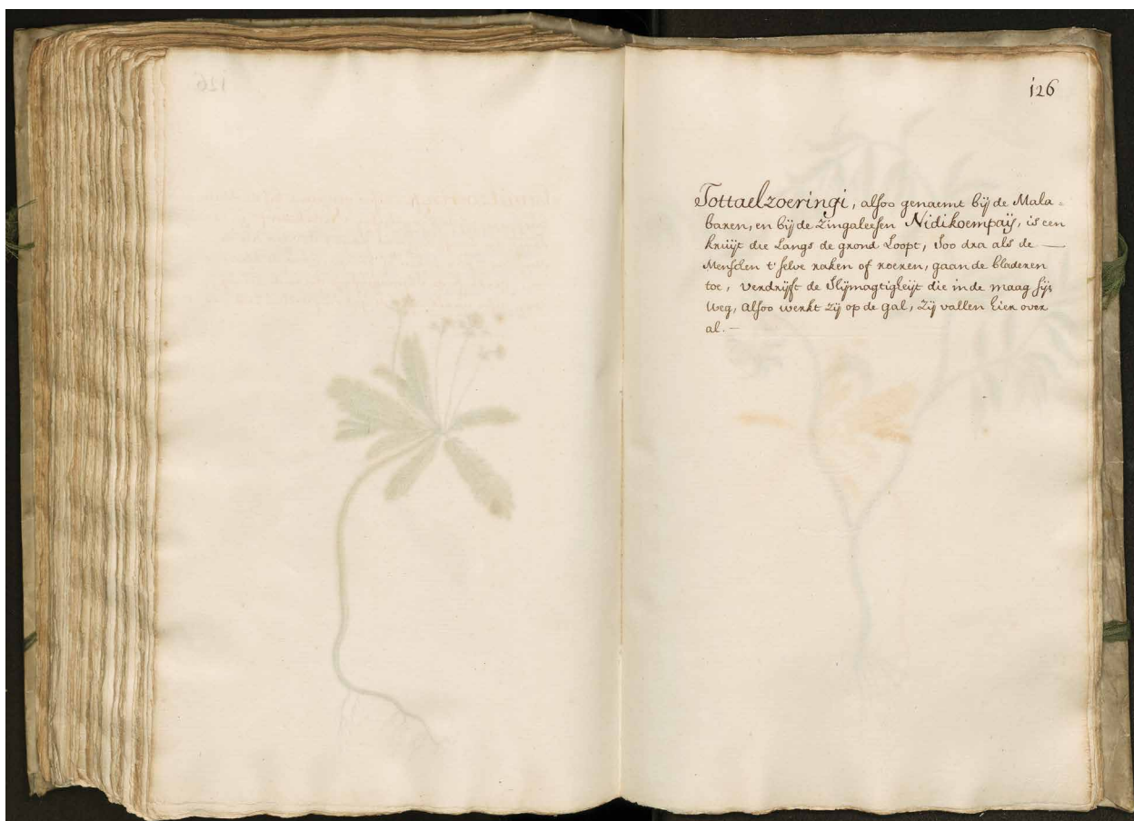
Fig. 12b Handwritten text by a VOC scribe, describing Biophytum hermannii , its local names and medicinal uses. Manuscript BPL 126 D, Leiden University Library Special Collections.