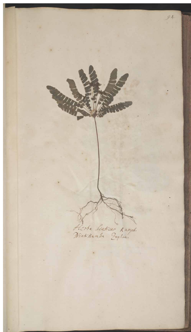
Fig. 8 Folio 94, Vol. II of the Hermann herbarium in Leiden. Biophytum sensitivum .