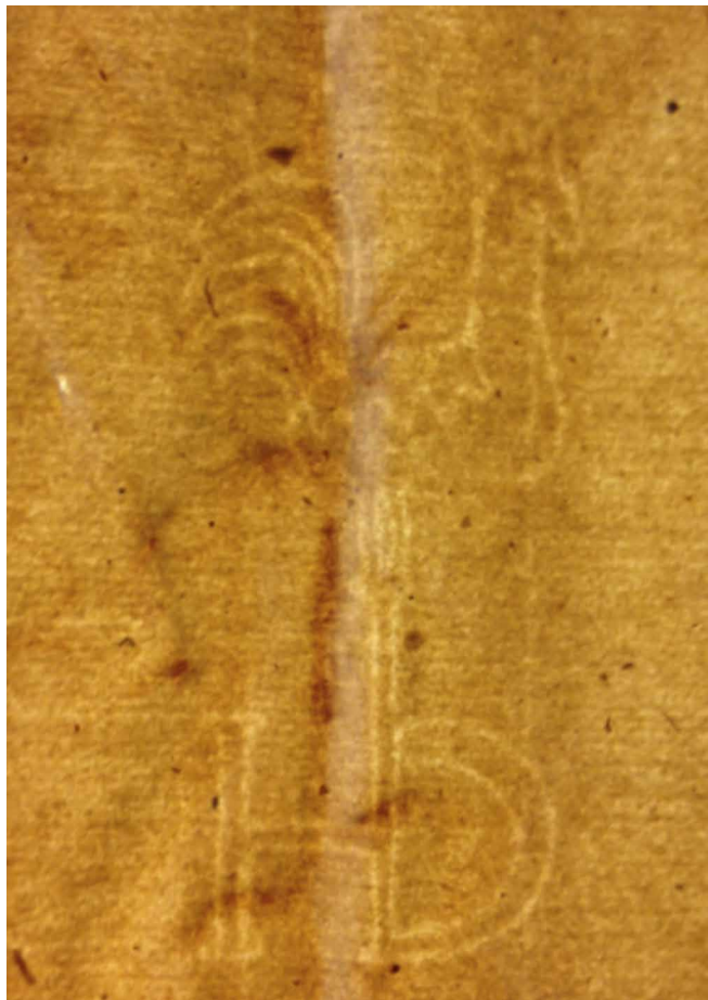
Appendix 2 Watermark with a rooster and the letters H and D, present only on page 165 in Volume II of the Leiden Hermann Herbarium.