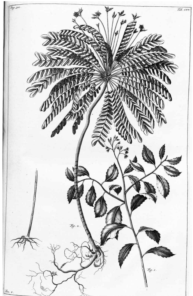
Fig. 11 Illustration of Biophytum sensitivum from the printed version of the Herbarium Amboinense (Rumphius 1747: 301).

In the Herbarium Amboinense , Rumphius referred several times to Hermann's publications from 1687 and 1691 and mentions his position as a Professor in Botany in Leiden (Buijze 2004). Hermann's publications are generally catalogues without much detail, but Rumphius cited Hermann on specific aspects of plant morphology, Sinhalese names and uses that cannot be traced