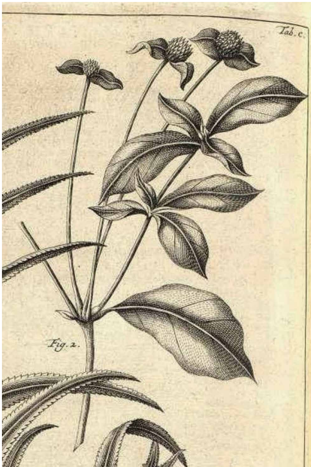
Fig. 4 Illustration of Gomphrena globosa in the printed version of the Herbarium Amboinense (Rumphius 1747: 289).