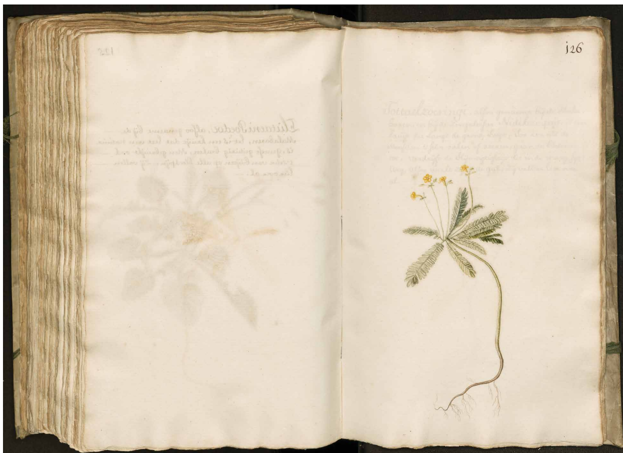
Fig. 12a Drawing of Biophytum hermannii by an anonymous artist in Sri Lanka around 1700. Manuscript BPL 126 D, Leiden University Library Special Collections.