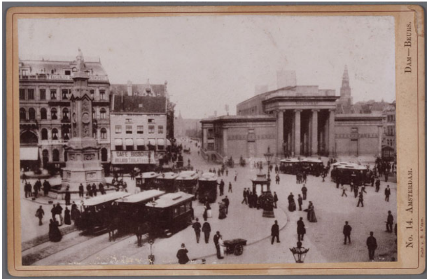
Figure 6: (Colour online) Picture postcard of Dam Square in the 1880s. 'De Dam gezien naar de ingang van het Damrak', c. 1886–89.

The initial meaning of the Amsterdam statues and memorials faded over time and became replaced by other associations and usages. Here, a central location could also turn out to become a disadvantage in terms of popular awareness. The national monument on Dam Square was by far the most visible to both visitors to Amsterdam and its inhabitants. Every day, thousands of people would pass the statue, but did they also take notice of it? It appears that at the turn of the century, busy city life was taking up all the attention, as was remarked by a newspaper reporter: