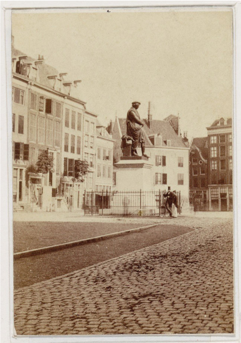
Figure 3: (Colour online) Posing in front of the seventeenth-century painter.