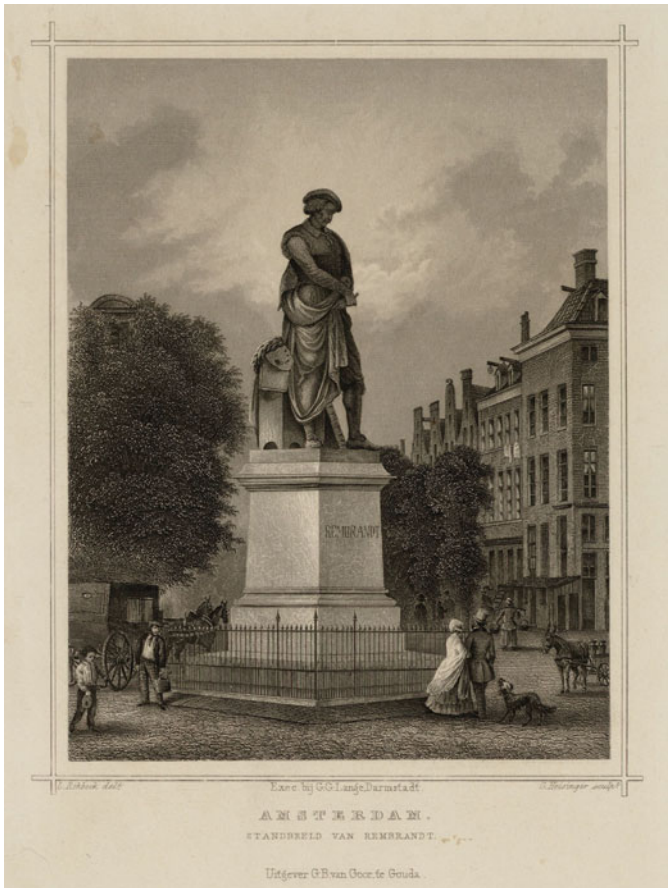
Figure 2: (Colour online) This engraving of the Rembrandt statue from 1855 shows city dwellers in admiration of the monument and was probably made for commercial purposes.

the monument. Unfortunately, we know little about the manufacturing process. The drawings, engravings and lithographs were commercial products; shortly before and after the unveiling ceremonies, newspapers advertised prints in a wide price range. This practice suggests a market and a popular response.