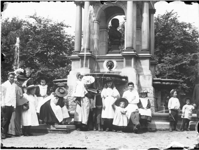
Figure 4: A group of children from the higher middle class and their nanny in front of the Sarphati bust. The photo was taken by the Amsterdam street photographer Jacob Olie (1834–1905) on 23 July 1896. Stadsarchief Amsterdam, Collectie Jacob Olie Jbz 10019/40074469, ‘Sarphatipark’, 1896.

who produced a wide array of snapshots of the city. 68 Part of this photographic production was intended for the commercial market, as were the drawings, engravings and lithographs. Picture postcards proved to be especially popular. 69 These postcards often showed the monuments isolated from city life, in black and white or coloured afterwards in order to create a ‘realistic’ feel. Only at the turn of the century do the postcards start to show more inhabitants and city life.