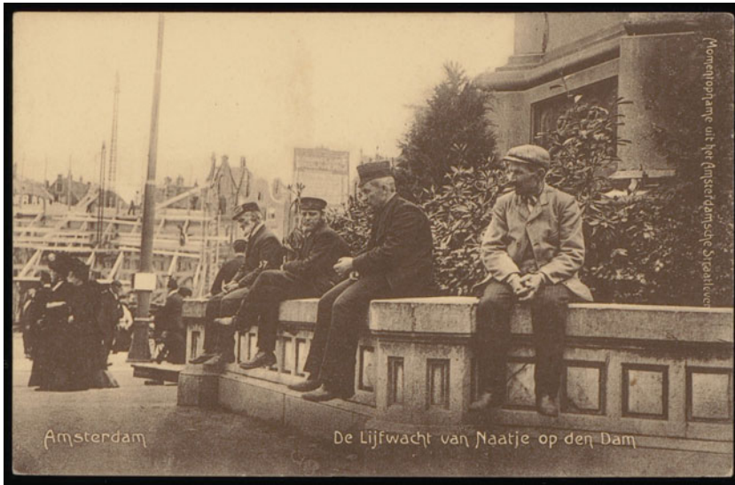
Figure 7: (Colour online) The – permanently empty – water basin of the monument on Dam Square was used as a hangout spot by elderly workingmen, a practice complained about by members of the Municipal Council. ‘De Lijfwacht van Naatje op den Dam’, c. 1910.

This example makes us aware of how the public statues and memorials were part of a constantly changing environment. The photographs of the nineteenth-century monumental landscape show how space could also lose its (nationalist) agency. The nineteenth-century public monuments started to experience competition from all kinds of other objects that made their appearance in the modern streetscape, from streetlights to post-boxes, clocks, advertisements and newspaper stands. Interactions with the statues and memorials could be in line with the intended meaning, like the young Theo Thijssen taking off his cap for the statue of Thorbecke, but city dwellers could also completely ignore the ideological and symbolical background. For the customers on the Botermarkt, the lover waiting for his date at the foot of Thorbecke, or the city dwellers mounting the tram on Dam Square, the sculptures in bronze or stone were only part of an urban décor (Figure 7). Unfortunately, pleas for saving the monument on Dam Square from the advancing modernization were in vain. 77 In 1914, the statue was dismantled and replaced by a railway track.