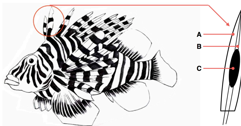
Figure 1. Morphology of venom glands in a scorpionfish. For venom fish, venom glands are usually located in their pectoral and dorsal fins. As shown in the right enlarged image, venom spines are typically composed of spine (A), connective tissue (B) and venom gland (C).

Multi-omics studies using next-generation sequencing (NGS) and liquid chromatography-tandem mass spectrometry (LC-MS/MS) technologies advanced considerably, leading to more sensitive and efficient research of venoms [10,11]. These techniques have been proven to be successful in several fields, such as neuroendocrine research and drug discovery [12]. Further, utilization of de novo assembling algorithms for deep sequencing has been widely applied in large-scale genomic and transcriptomic sequencing projects, with accurate assembly of fragment data into full-length transcripts, in particular in the absence of a reference genome sequence [13].