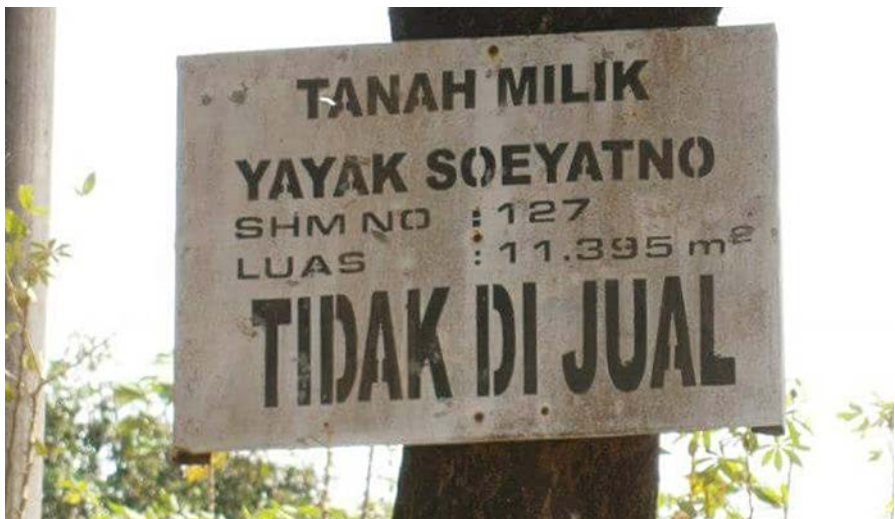
Figure 6.3 A sign board stating that the land was not for sale in Moncongloe indicating the emerging of land conflicts in the area

This new development in Moncongloe is parallel with the analysis given by Persoon and Simarmata (2014) that the marginality of an area is never permanent. They point out that the changing of perspectives or new market opportunities may lead to a redefinition of marginal areas. They argue that the marginality of lands can be undone by a variety