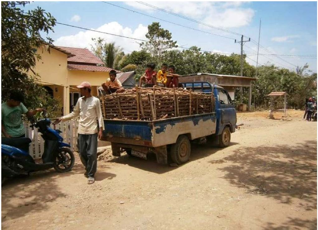
Figure 6.7 A mini truck loaded with fresh cassava in Moncongloe