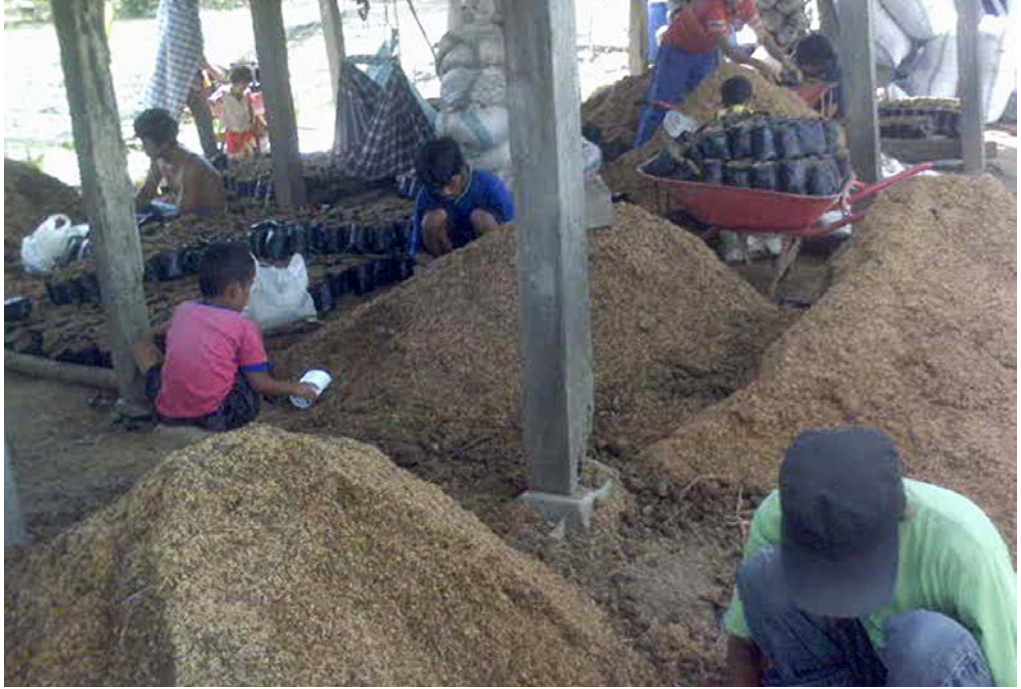
Figure 6.4 Villagers preparing polybags at PT JOP nursery in Moncongloe in 2008

and later on to 14 additional districts in South Sulawesi. For the company, Moncongloe had a strategic position, not only for its status as the pioneer in their jatropha investment but also for its short distance to the Sultan Hasanuddin Airport and Makassar City which enable them to use Moncongloe as their favorite showcase site to their prospective investors.