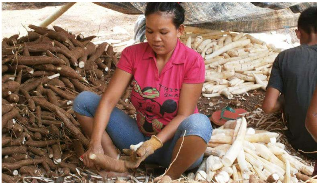
Figure 6.8 Workers peeling cassava in Moncongloe

allowed to harvest and sell the fruits – with some are delivered to the owners, but they are not allowed to plant new trees as well as to cut down the existing trees because the trees are considered as assets by the new owners.