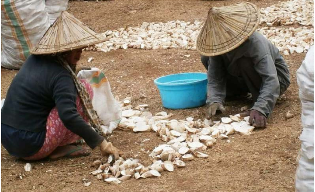
Figure 6.6 Villagers drying cassava chips in Moncongloe