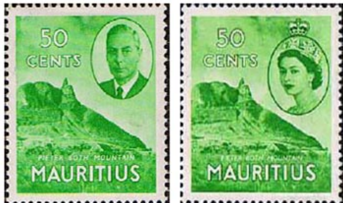
Figures 14 and 15: reproductions of old drawings on postage stamps of Mauritius 35