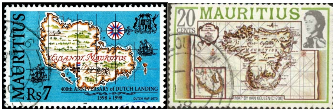
Figure 11: Dutch map of 'T Eylandt Mauritius, 1670 and Figure 12: Van Keulen's map of Mauritius, c. 1700.

And some names on Mauritius (like the name of the Island itself of course) directly or indirectly refer to the Dutch period, directly as in the case of Pieter Both mountain (see figure 13), and indirectly as in the translation of earlier Dutch names Swarterivier in Black River or Noordwijkse Vlakte in Flacq 33 . Finally a lot of drawings were made during the Dutch period by travellers on