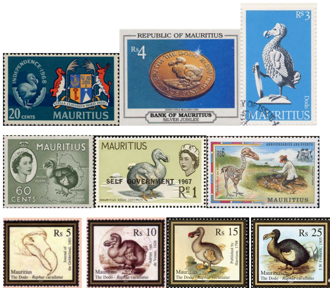
Figure 19: dodos on Mauritian postage stamps 40

heritage on stamps' in Mauritius. The combined figure 19 shows the evidence on Mauritian stamps, including the coat of arms of Mauritius, and a coin which includes the dodo! The dodo became an emblem of the extinction of animals, or as Turvey and Cheke (2008) call it: "an extinction icon". Hence, some foreign countries also copied pictures of the dodo on their postage stamps (see figure 20 for examples), but unfortunately not the Netherlands. Mauritius features once on a Dutch stamp, but that is because of a Mauritian postage stamp that became one of the most iconic images of the world's philatelic heritage: see Figure 21.