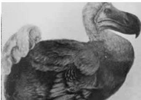
Figure 6: the dodo as illustration of the Dutch period in the history of Mauritius 21 .

And the only illustration it adds is a drawing of a dodo, reproduced as figure 6 (also see the final part of this chapter).