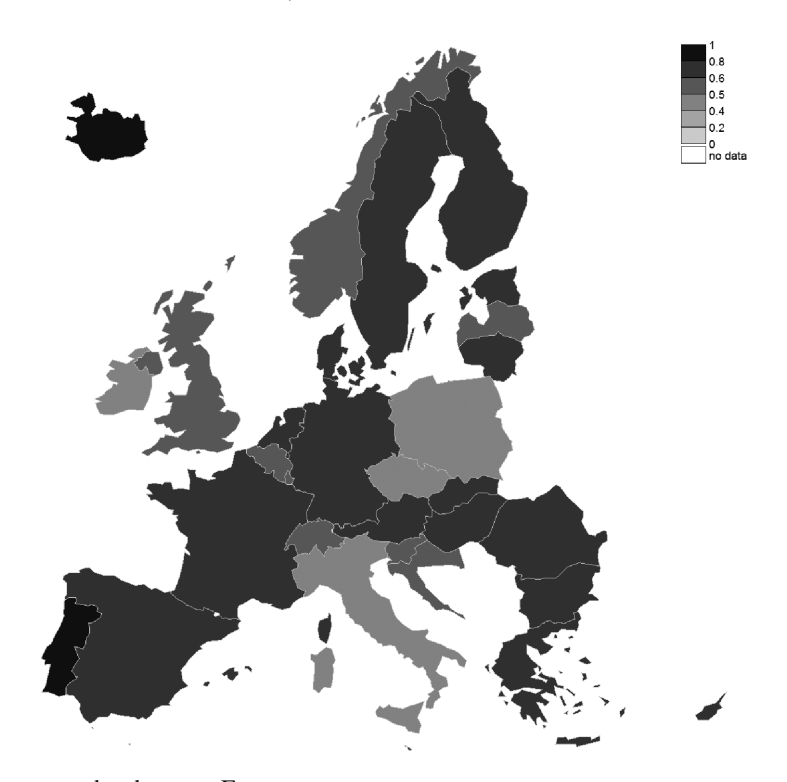
Figure 3. Congruence levels across Europe. Notes: Darker shades indicate higher opinion-policy congruence (cf. Table 2). The mean level is 63 per cent (Denmark and Finland), the minimum is 41 per cent (Italy and Poland) and the maximum is 100 per cent (Iceland).

systems might make it more difficult for governments to provide the policies that the public wants. The average predicted probability of congruence (based on model 8), with the covariates at their observed levels, is 69 per cent in unicameral systems, whereas it is only 57 per cent in bicameral systems. We also find that policy is more likely to reflect the opinion of the majority of the public the larger the majority; this corresponds with the finding that the likelihood of policy being enacted (not enacted) is correlated with the degree of support in favour of (against) it. Finally, congruence is more likely the more salient a policy issue is in the news media. <sup>16</sup>