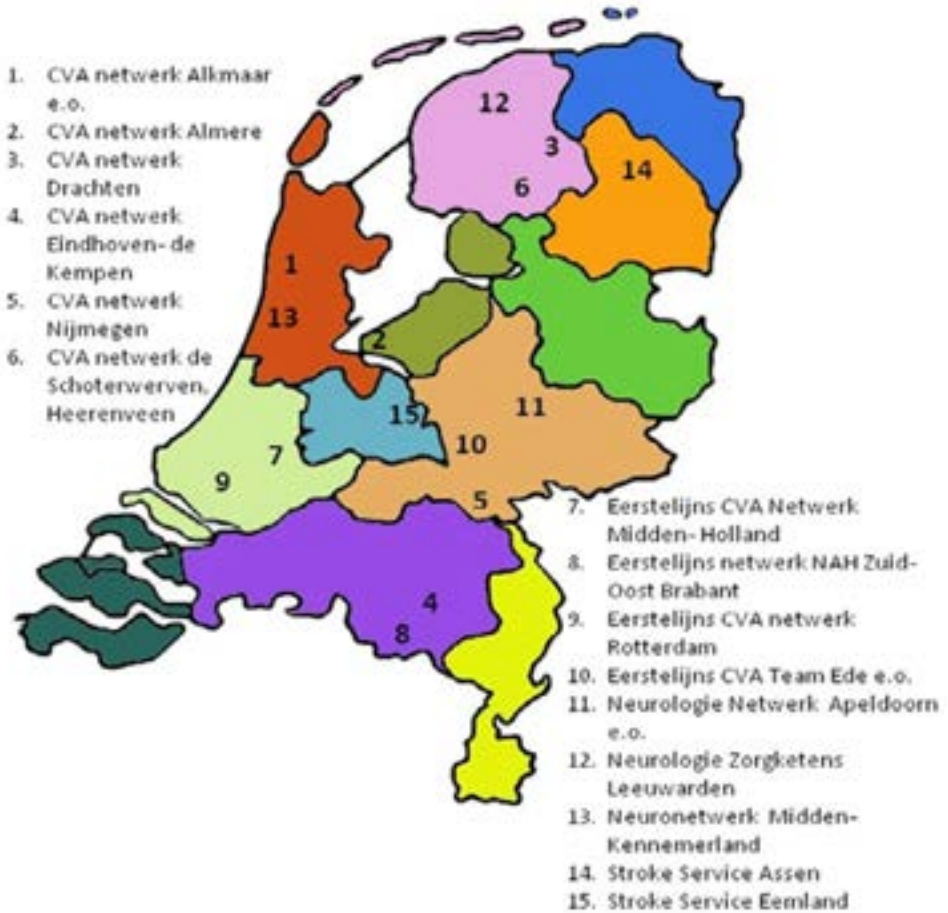
Figure 1. Geographical distribution of fifteen stroke networks that were identified in The Netherlands.