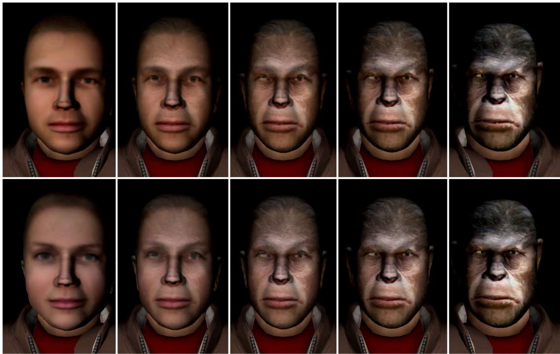
Fig. 2 Some representative images resulting from the morphing procedure applied to male (upper panel) and female (lower panel) faces. From left to right, 100% human and 0% ape, 75% human and

25% ape, 50% human and 50% ape, 25% human and 75% ape, and 0% human and 100% ape. The resulting 100% ape face was identical regardless of whether the male or the female face was morphed