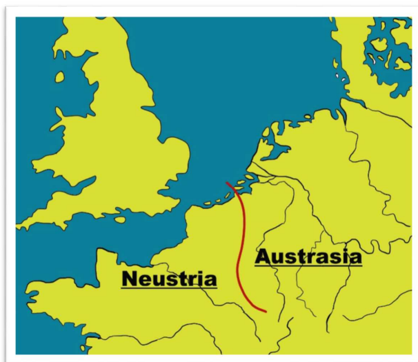
Figure 3 Austrasia and Neustria in Merovingian Gaul