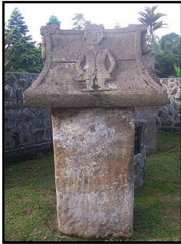
Figure 3.1. A preserved waruga in the village of Sawangan (Airmadidi)

rights by the Company to village corvée labor from converted alfur . 28 Using the authority emanating from the Company, the chiefs could thus solidify their authority over their subjects. The stabilizing authority of the Company was advantageous for the aspiring chiefs given the long-standing political situation wherein competing chiefs could “woo away” 29 another’s followers. Such a phenomenon notably occurred during ritual feasts where “prestigious men” displayed their keter to attract would-be followers. 30