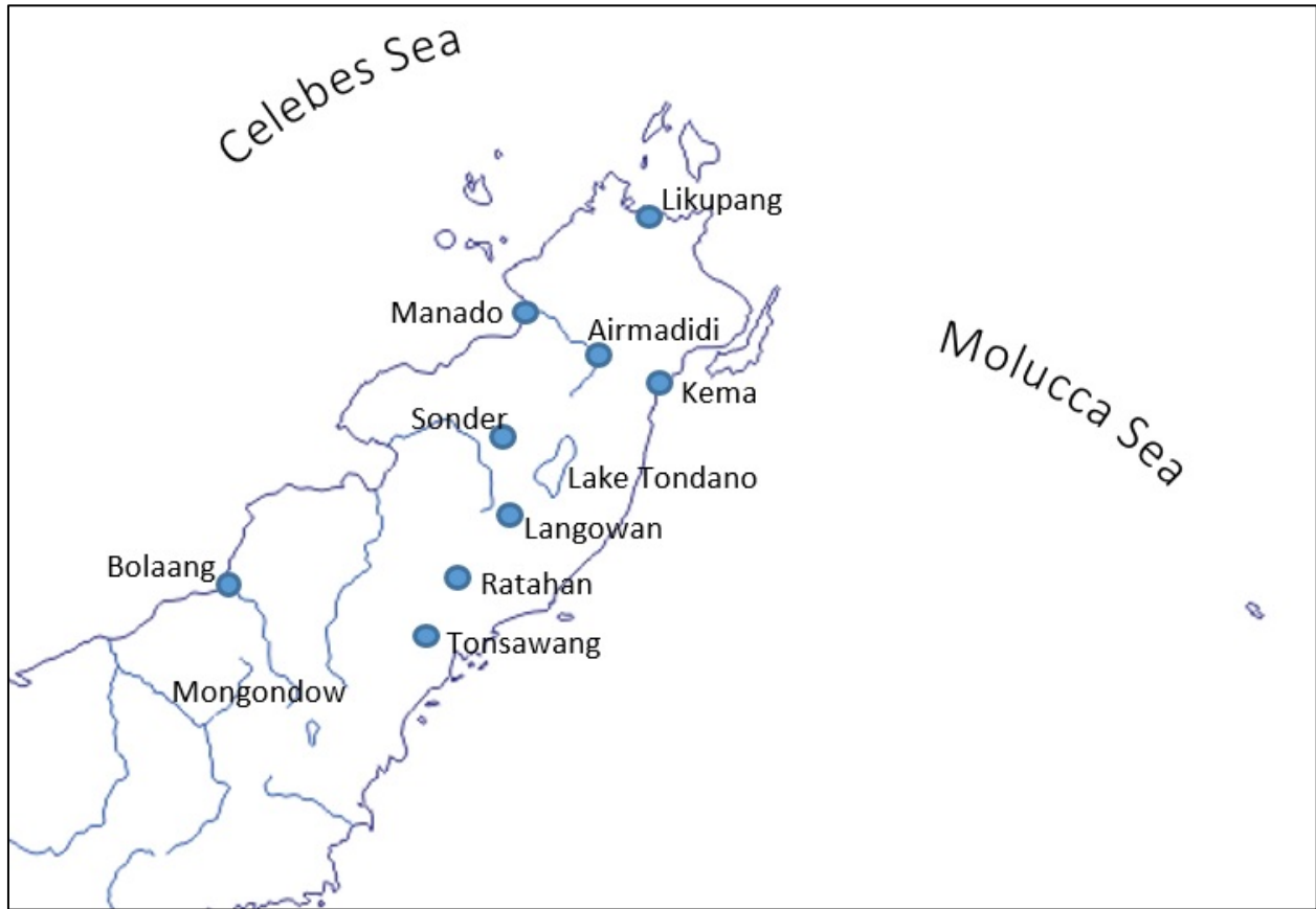
Map 3 Map of Minahasa (Map by author)