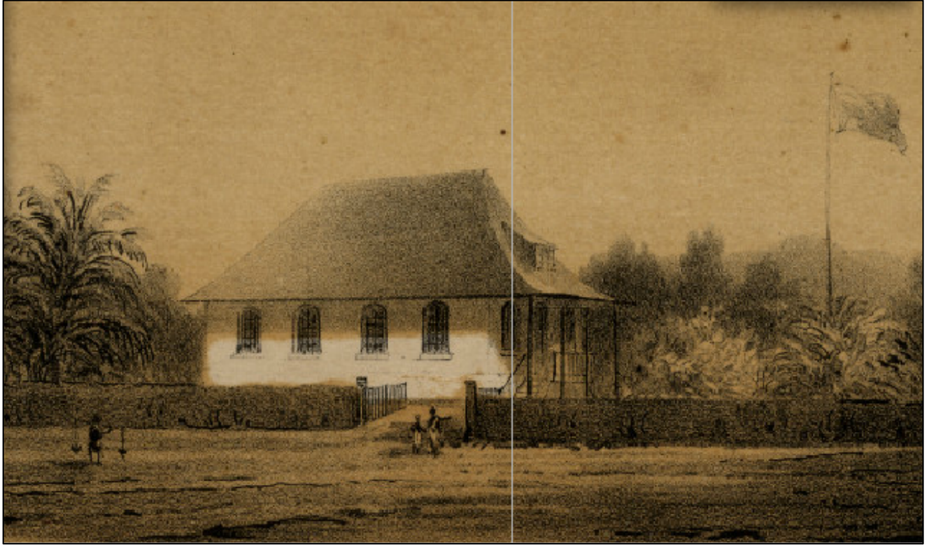
Figure 3.2 Church in Tomohon, c. 1850 207

Like Pelenkahu, most of the hukum besar were supportive of these changes. 208 By the 1850s most of the highest-ranking chiefs were not only Christians but also “younger men” who were said to be “different from the older chiefs.” 209 These younger chiefs, Pelenkahu included, would have been born or grown up in the political and economic context of direct colonial rule underpinned by the system of compulsory deliveries and with little or no memory of the older Minahasan political system. They would also have been likely educated in the missionary schools in the district center or perhaps even in Manado. As such, for this younger generation of chiefs it was easier to conceive of their political edge over potentially competing chiefs by riding on Jansen’s Christianization cum centralization project.