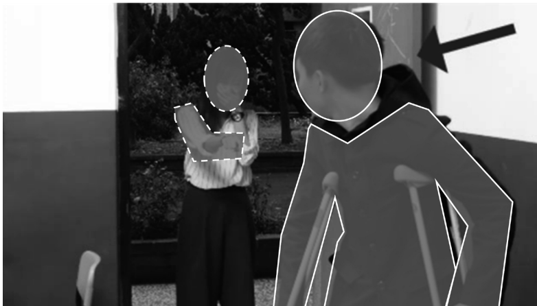
Figure 1. An example last scene of video presentation. The areas within the white lines denote the four areas of interest used in the analyses (solid lines denoting the target person; dashed lines denoting the interaction partner). The white lines were not presented to the participants during the experiment.

We preselected four areas of interest (AOIs), corresponding with four emotional cues: target person's head, target person's body, partner's head, and partner's action (e.g., an arm engaged in the action of pushing or pointing at someone; see Figure 1 for an example). Children's eye movements were measured by the eye tracker at a sampling rate of 120 Hz using corneal reflection techniques, and processed by Tobii Studio 3.2.1. Using a Dynamic AOI tool provided by the software, we predefined AOIs by drawing freeform shapes, frame by frame. Tobii I-VT fixation filter was applied to define fixations. Only the sampling points where both eyes were detected by the eye tracker were included in later calculations. The total fixation duration within each AOI was the sum of the duration times for all fixations within an AOI. Fixation ratios were calculated by dividing total fixation durations within each AOI by the total fixation duration within the entire screen. Moreover, we calculated the fixation ratio within the video frame to examine attention to the videos.