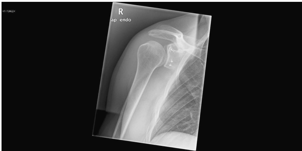
Fig. 3: X-ray of right shoulder with four bone anchors in place.

Again, no dislocation or subluxations occurred after surgery with VAS scores for pain of 0 (in rest and for activity). At the final follow-up, the shoulder showed good functional outcome scores, with an exorotation of 80° (in 0° of abduction of the arm) versus 90° on his contralateral non-operated right shoulder. His sports activities at the final time of follow-up were running and skiing. Remarkable was that he luxated his non-operated left shoulder after surgery by a fall with skiing, while his operated right shoulder remained stable.