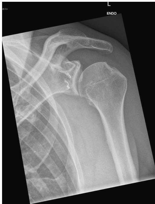
Fig. 2: X-ray of left shoulder with three bone anchors in place.

No more dislocation or subluxations occurred after surgery with VAS scores for pain of 0 (in rest and for activity). At the final follow-up, the shoulder showed good functional outcome scores, with an exorotation of 70° (in 0° of abduction of the arm) versus 90° on his contralateral non-operated right shoulder. His sports activities at final time of follow-up were hockey, fitness, and skiing.