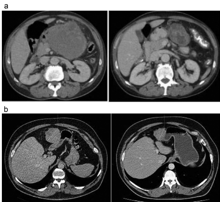
Figure 2: (A) Radiological response in a neo-adjuvant treated D842V-mutated GIST patient. (B) Radiological response in a D842V-mutated GIST patient treated with palliative intent.